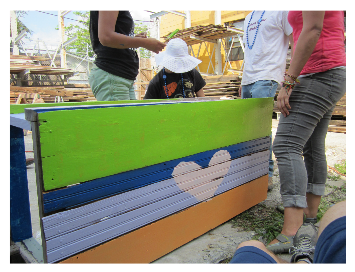
Figure 6: Bench decorated by service trip volunteers

coming to an end, the students painted over the text they had already written and the day ended with the bench painted in green, blue, light blue and orange stripes with an offwhite heart at its center. A photo, included below, reveals the word Hillel barely visible beneath a second coat of green paint.