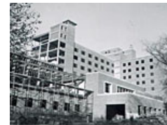
South Quad Dorm under construction, May 1952