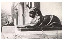
Pumas at entrance to University Museums Building

1913 - Department of Architecture established, it becomes a College in 1931. Architecture had been a sub-department under the Department of Engineering from 1906-1913.