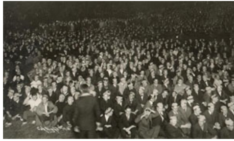
Cap Night, 1916

1904 - First "Cap Night" celebrated on June 11, later to be abolished in 1934. 7