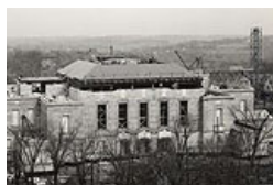
Rackham Building construction, March 1937

1937 - Newberry Hall is purchased by the University of Michigan. The archeological collections move into Newberry Hall in 1928, and the museum is named the Kelsey Museum in 1953. 16