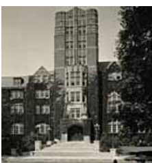
Front of the Michigan Union, ca. 1950

1947 - Center for Japanese Studies formed.