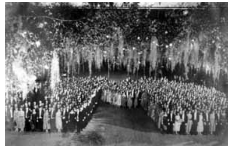
Junior Hop, 1920

1900 - "In 1900, when interdepartmental rivalry ran high among the students, the "Lits" [Literature students] raised the class banner, flaunting the numerals of the class, to the top of the University flagpole. The enraged "Laws" [Law School students] enlisted the aid of a sharpshooter from the West, who brought the emblem down at the second shot. During the early 1900's, the practices of haircutting, face-painting, house-raiding, kidnapping - particularly of officers of the rival classes - were common." Read more about student traditions and rivalries . (from The University of Michigan, an Encyclopedic Survey , p. 1775)