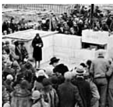
Women's League Cornerstone Laying