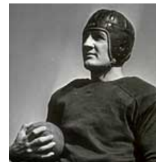
Tom Harmon, 1940

1981 - Women's athletic programs officially admitted into the Big Ten Conference. 20