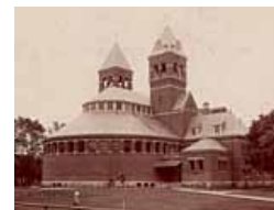
Original General Library