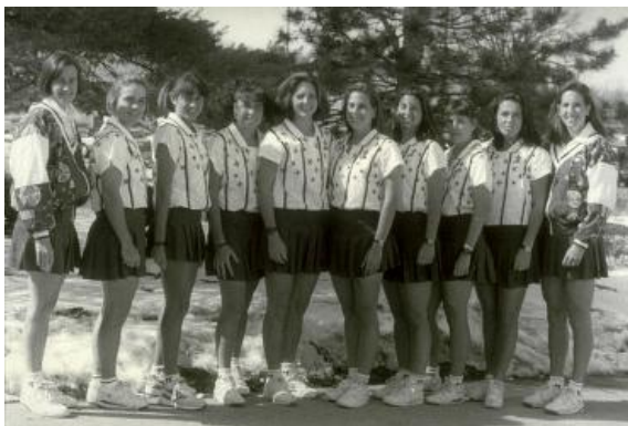
1994 UM Women's Tennis team