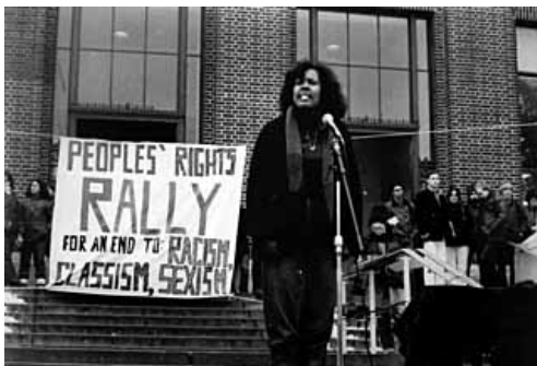
People's Rights Rally, January 1, 1981

1853 - Samuel Codes Watson, medical student, is the first known African American student admitted to the university. 1