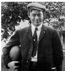
Fielding H. Yost

1899 - The nickname " Wolverine " applied to UM football teams first appeared in the Michigan Daily on November 11, 1899. 6