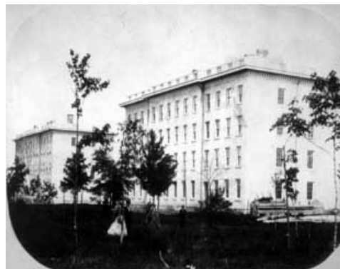
Mason Hall, 1861 Original University Instructional Building in Ann Arbor, built in 1841