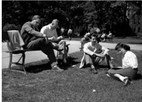
Students Studying on the Lawn, 1946

1845 - First fraternities, Beta Theta Pi and Chi Psi, established at Michigan. 1