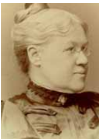
Dr. Eliza M. Mosher

women, and becomes first woman faculty member. 20