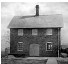
First Engineering Building at University of Michigan, ca. 1882

1894 - Literary Class of '94 is the first to wear academic gowns at a Michigan commencement. 9