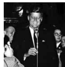
JFK Peace Corps Speech at Union

1960 - On October 14 John F. Kennedy announces the concept of the Peace Corps during a presidential campaign stop on the steps of the Michigan Union. 63