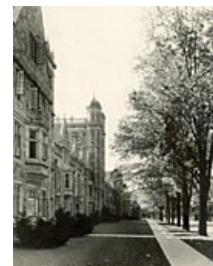
Lawyers Club, ca. 1925

1954 - Department of Atmospheric, Oceanic, and Space Sciences founded. 22