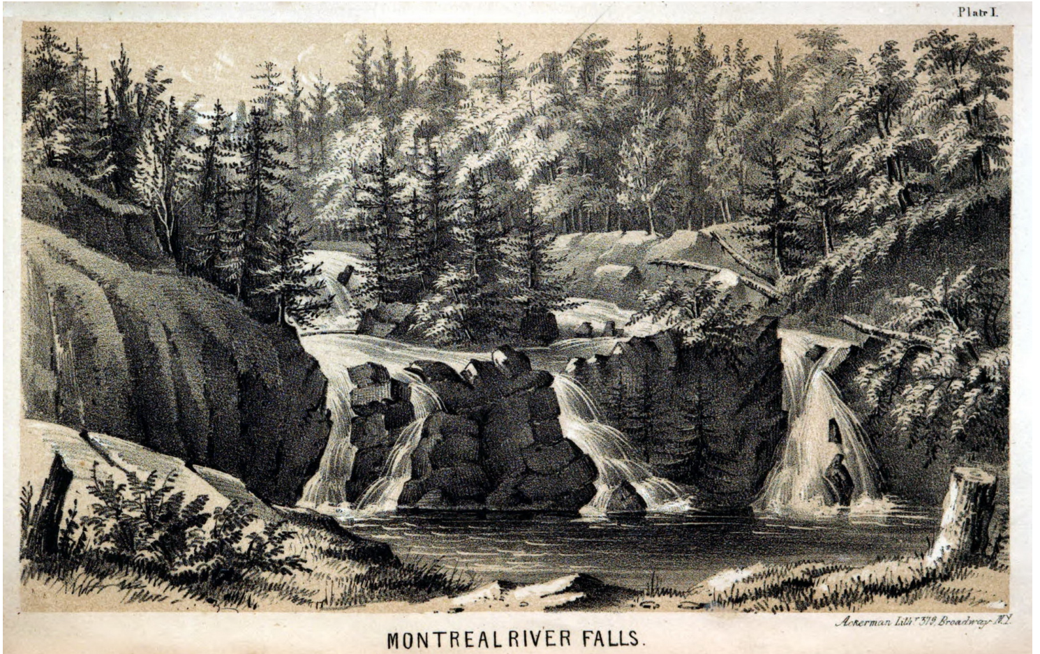
MONTREAL RIVER FALLS.