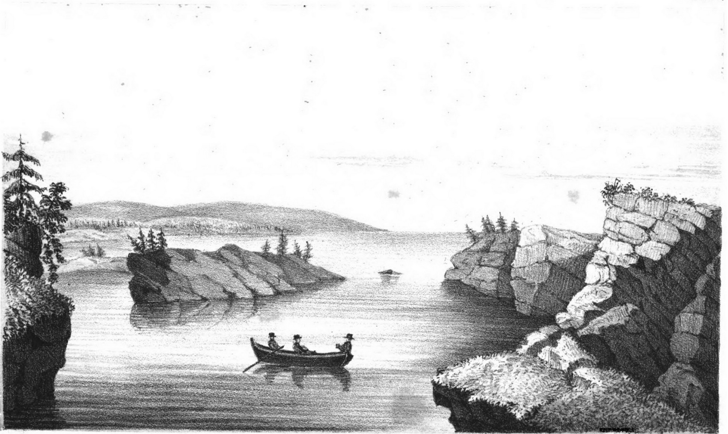
HORSE-SHOE HARBOR L.S.