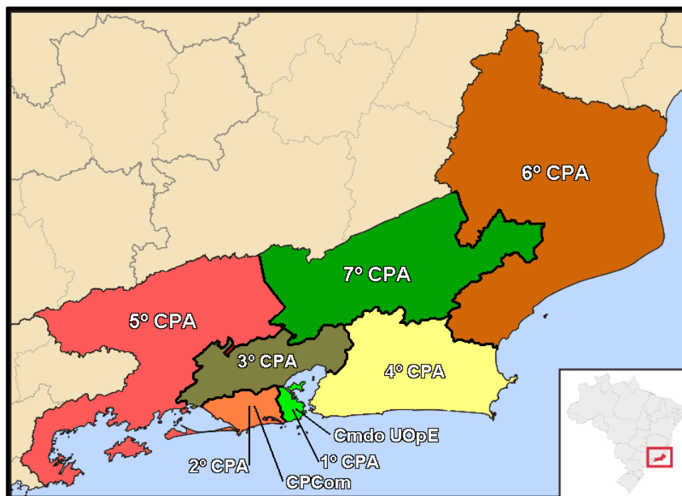
Figure 2: For purposes of this image, substitute “CPA” for “RISP.” 4

RISPs are important to the implementation of the UPPs, as they indicate which areas of Rio the UPP targets. Since its initial implementation in 2008 in the Santa Marta favela, UPP units have drastically favored RISP 1 (Capital: South, Center, and North Zones). From 2008 to 2010, the UPP installed 11 more units in RISP 1 favelas. From 2010 to 2012, 15 more UPPs appeared in RISP 1, and from 2012 to 2014, 12 more UPPs were installed in RISP 1 (Figure 3). In the same time frame, RISP 2 (West Zone) accumulated three UPP units, two of which – Cidade de Deus and Jardim Batan – were implemented shortly after Santa Marta in January 2009. The third UPP unit in RISP 2 was then implemented in the Vila Kennedy favela in late May of 2014, over three years later. The last RISP and second-to-last UPP implementation finally reached RISP 3 (Baixada Fluminense) with Mangueirinha in late May of 2014. 5