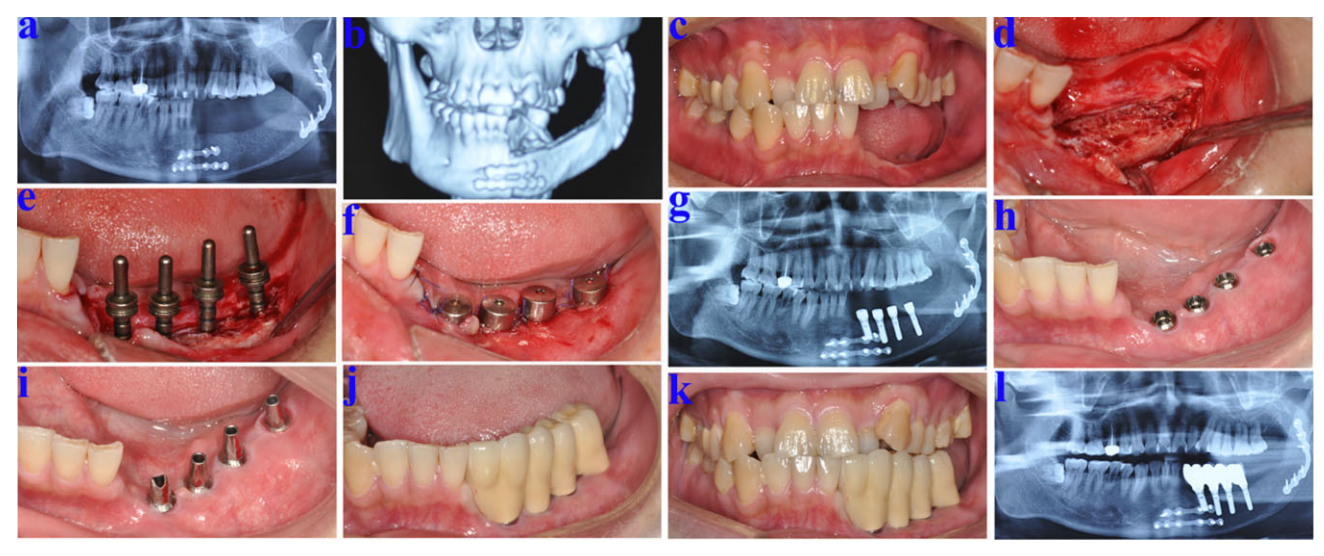
Figure 3 Clinical view of a mandibular defect reconstruction after tumor resection using conventional implants (CIs) (phase II with a lateral segment without a condyle [L]-type mandibular bone defect). A–C, clinical diagnosis using panorama and computed tomography; D–G, implant placement in the area of the ilium graft; H–L, implant-supported, fixed prosthetic rehabilitation.

surgical removal of the gingival hyperplasia failed. Because of the regular follow-ups and attentive oral hygiene practices, the annual mean number of complications/repair was lower (0.11–0.07) per patient in this study. More importantly, over 80% of patients were fully satisfied with the reconstruction of oral function, including the facial contour, the function of their prosthesis, the comfort level of the prosthesis, and their mouth opening and enunciation. The patients with only partial satisfaction may have had excessively high expectations for the outcomes of the oral reconstruction.