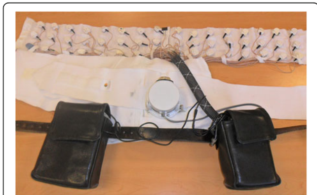
Figure 1 Vibrotactile feedback device. The vibrotactile display, elastic corset, IMU, PC104, and battery pack.

Post-processing was performed using MATLAB (MathWorks, Natick, MA). The IMU raw data was low-pass filtered using a 4th order Butterworth filter (filtfilt.m). Gait initiation and termination were excluded prior to calculating all parameters. The root-mean-square (RMS) of M/L and A/P tilt and overall sway was calculated over a fixed distance for each trial. Percentage of time spent in each of the tactor activation zones (null, low, high) was also calculated on a trial-by-trial basis. Pacing information was approximated from the number of hand-counted gait cycles and the sampling rate. Individual repetitions comprising sets of similar display configurations were averaged