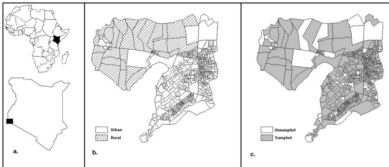
Figure 1 Maps of study area in Kisumu, Kenya. Maps include (a) region of study, (b) urban/rural designation of census enumeration areas (EAs) within study area, and (c) sampled and unsampled EAs.

area, data collection was limited to the 13 administrative sublocations of the city (roughly equivalent to large neighbourhoods) with overall population densities > 1,000/\text{km}^2 . This density threshold has been used to define "urban" in a recent review of malaria morbidity and mortality across Africa [26]. At smaller scales, population density within the study area varied considerably. The study area encompassed a range of urban ecotypes with variation in factors likely to influence malaria risk, including land use/land cover, economic and agricultural activity, distance from urban shops and health facilities, and environmental features. The study site comprised 202,282 people in 54,403 households (Table 1) [25], over an area of 62.3 \text{ km}^2 .