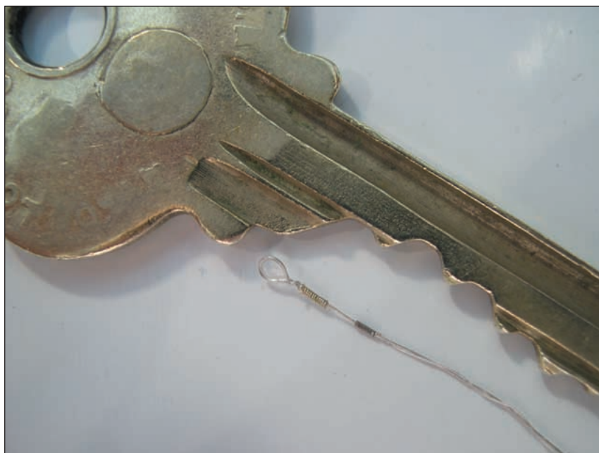
Figure 1. Miniaturized sensor, approximately the size of a small thermocouple, under development for use in soils (Cardon et al. 2003).

Another experimental approach under development is the use of miniaturized sensors to provide in situ measurements of pools and processing of particular compounds in soils (Figure 1). These sensors, designed based on prototypes in the biomedical literature (Moussy et al. 1993), rely on immobilized enzymes layered onto a working electrode to produce a substrate-specific signal. The goal is to be able to slip these relatively inexpensive, miniaturized sensors into soil with minimal soil disturbance, in order