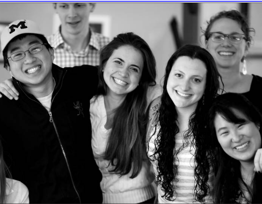
Sustainability Scholars celebrate 2013 graduation

Graham Sustainability Scholars often report that the interactions and relationships with the other students in the program are the most important elements of their experience.