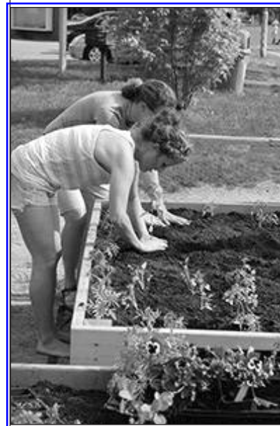
Students create a vegetable garden as part of the "Sustainability & the Campus" course.

Media and politicians often simplify environmental and social issues, casting them all as black or white, while Michigan's program emphasizes the complexity of sustainability in all scales of grey. Encouragingly, students' definitions of sustainability evolve significantly during their time in the program (Figure 1). At the beginning, student definitions are relatively simple, with a focus on environmentalism and resource conservation. By the end of the program, students define sustainability in a more complex way, integrating socially oriented