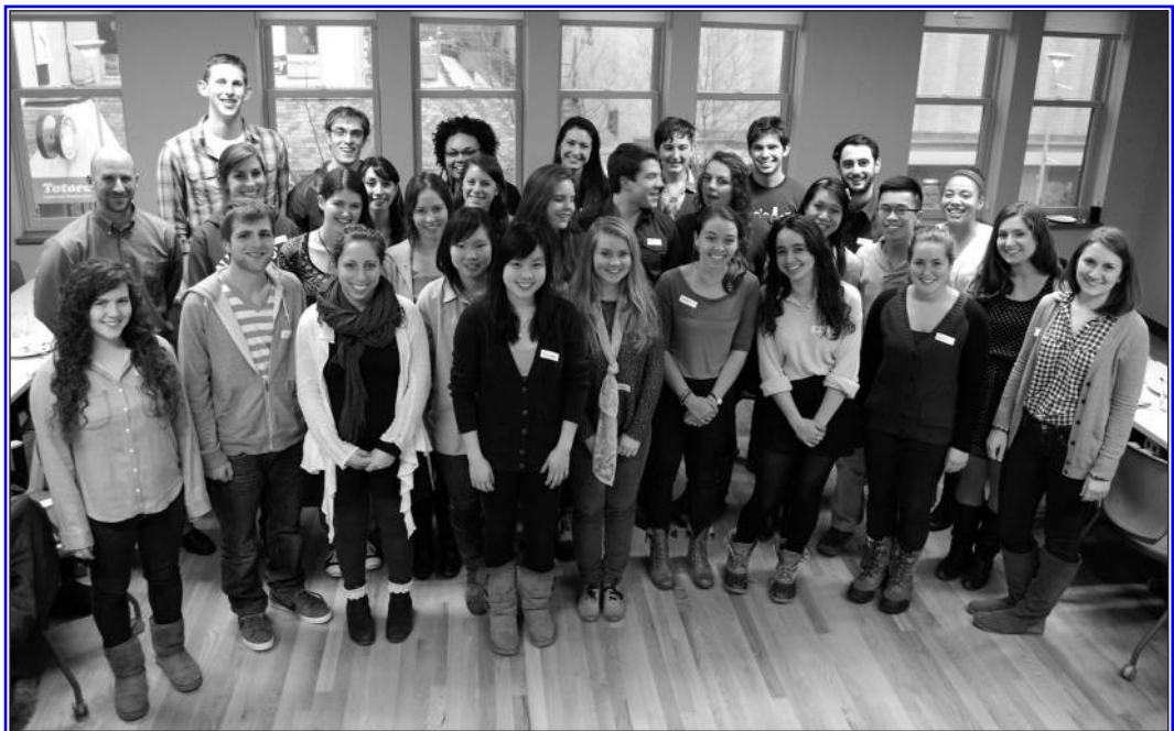
New cohort of Graham Sustainability Scholars in 2013