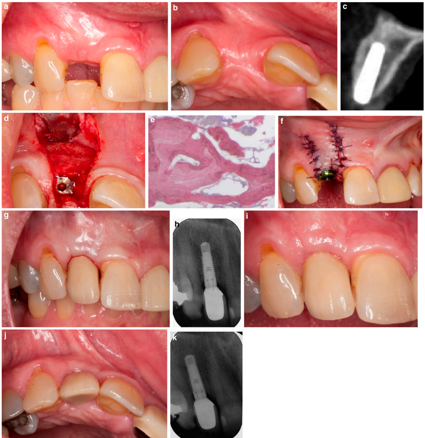
FIGURE 2a Preoperative buccal view. 2b Preoperative occlusal view. 2c Midsagittal CBCT view 6 months after implant placement. 2d Mature bone observed on the entire buccal implant surface. 2e Histologic image of mature bone formation around particles of bone allograft (Hematoxylin and eosin stain. Original magnification x4). 2f Healing abutment secured with flaps sutured. 2g Crown was delivered. 2h Periapical radiograph of crown at delivery. 2i Buccal view of crown at 1 year after implant placement. 2j Occlusal view of crown at 1 year after implant placement. 2k Periapical radiograph of crown at 1 year after implant placement.