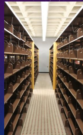
Empty Shelves at Kresge Library After the Books Left