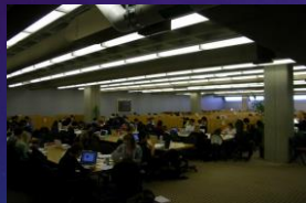
The OLD Kresge Library