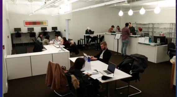
The NEW Kresge Library Services at the University of Michigan