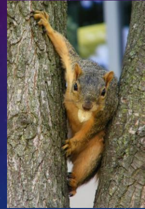
Squirrel at the University of Michigan, Ann Arbor