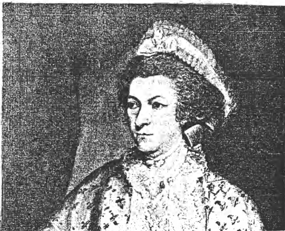
Abigail Adams (Portrait by Ralph Earl)

Abigail Adams, wife of John Adams, was born November 11, 1744. She died October 28, 1818. From the very beginning of her marriage to John Adams, Abigail Adams was forced to take a back seat to her husband's political career. She took on the huge responsibility of running the household when John traveled, often leaving their home for weeks and months at a time. This lack of support from her husband frustrated Adams. It forced her to take on the entire load of the household, from taking care of the children to caring for the financial dealings of the family. For example, Paul Engle states in his book entitled, Women