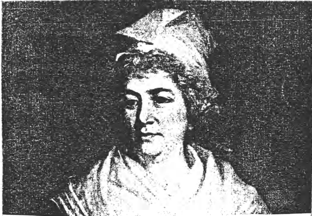
Sarah Franklin Bache (Portrait by John Hoppner)

Sarah Franklin Bache, daughter of Benjamin Franklin, died in 1808. During the American Revolution Sarah was an author and a relief worker. Sarah was an excellent organizer and was among the organizers led by Esther de Berdt Reed to raise money for General Washington's army..." (Engle 236) Along with her relief work, Sarah Franklin Bache also maintained her household, organized relief efforts for the troops, operated a nursery of eight children, and continued to write.