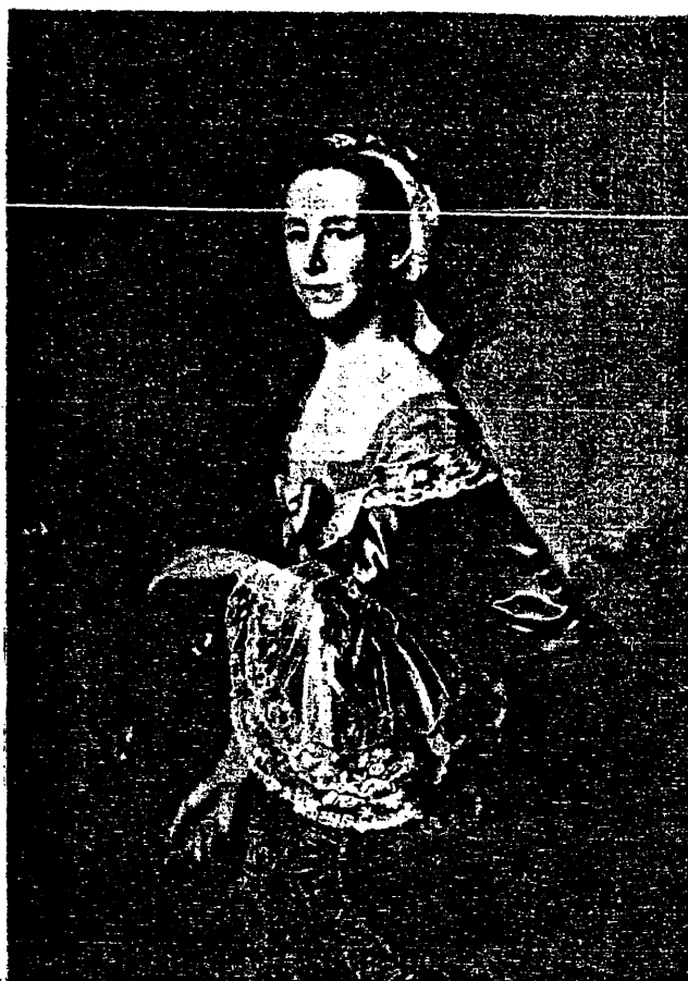
Mercy Otis Warren (Portrait by John Singleton Copley)