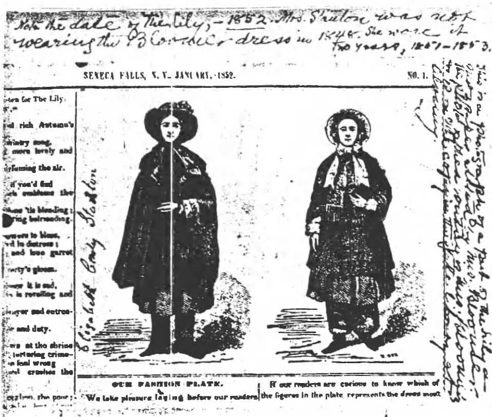
MRS. STANTON AND MRS. BLOOMER In the Reform Dress of the Early 1850's

The Seneca Falls Convention of 1848 was extremely important to the future of the American housewife. Not only was the convention an open forum for the resolution of the question of Woman Suffrage, but also it was the turning point of political openness among housewives. During the early to mid-nineteenth century, women began to assert themselves in ways, which only years before, had been