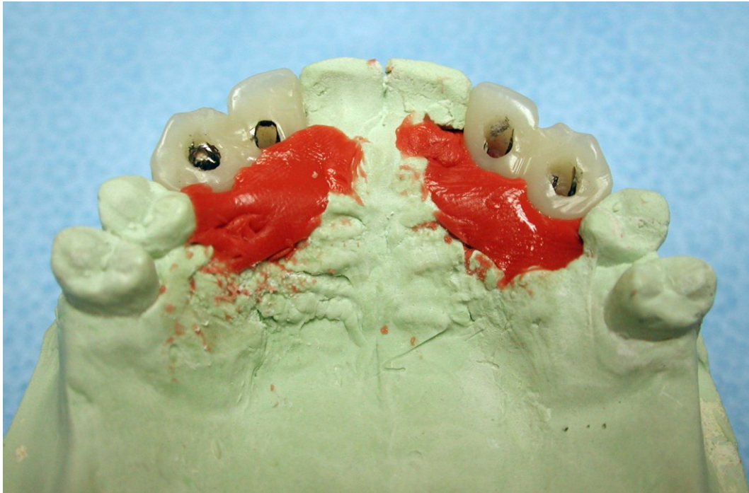
Figure 3. Space created after the removal of the provisional prostheses.