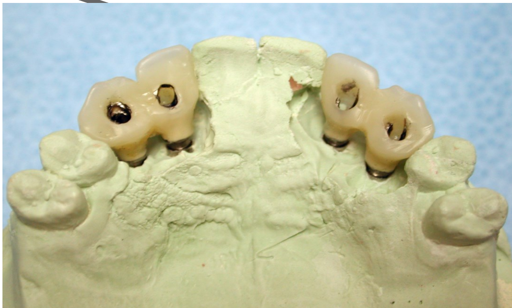
Figure 1. Interim prostheses secured on the initial cast after the removal of artificial gingivae.