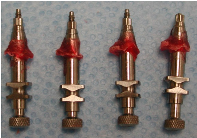
Figure 7. Custom impression posts are transferred directly from initial cast to mouth one by one using their positions on the cast as reference.