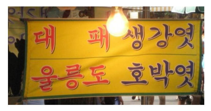
FIGURE 6 Street vendor's sign about traditional Korean taffy [Colour figure can be viewed at wileyonlinelibrary.com]

outdoor signs in Korean' (Lee, 2001 cited in Lawrence, 2012. P. 80). Although this policy is not always strictly followed, many signs in Insadong are indeed written exclusively in Korean, including some coffee shops. Figure 8 is a case in point; it is a coffee shop sign that contains no English. Even the word 'coffee' is presented in Korean script = 1 = 1 Also, notice the sign is made out of traditional rice paper, and the script is presented in a calligraphy style as well. The sign reads, 'Emperor's coffee aged in a clay pot'. The use of the word hangari ('clay pot') is also noticeable, as it is normally used to store traditional Korean fermented seasonings, sauces, and side dishes; it stands for something traditional and unchanging in quality over the years.