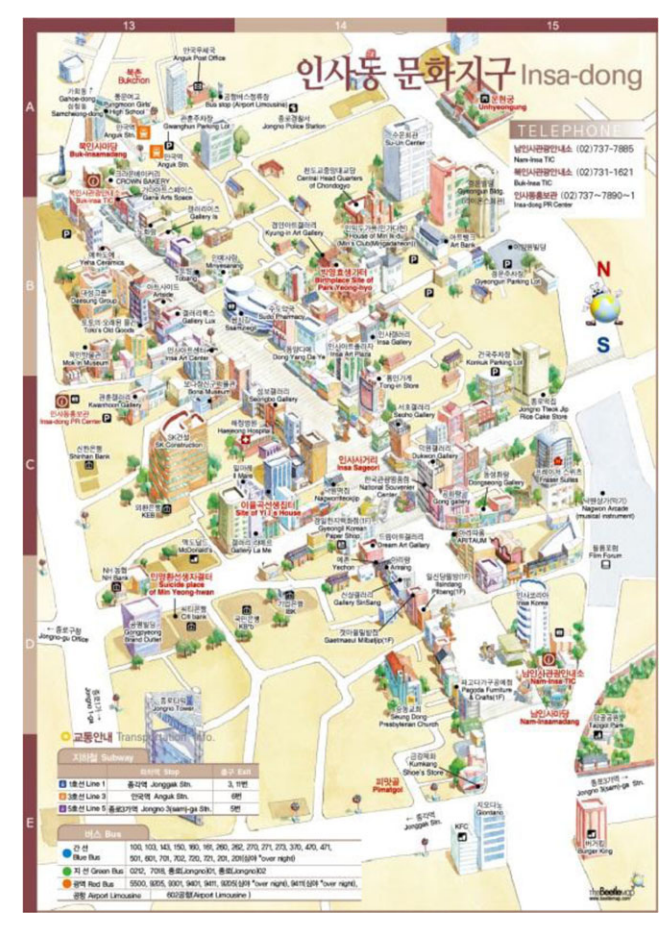
MAP 1 Map of Insadong<sup>1</sup> [Colour figure can be viewed at wileyonlinelibrary.com]