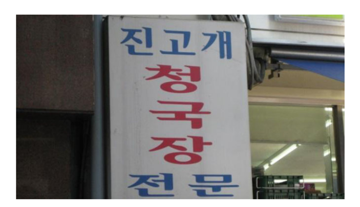
FIGURE 11 Restaurant sign specializing in Korean fermented soy bean paste soup [Colour figure can be viewed at wileyonlinelibrary.com]

toward authenticity' are often emphasized as a sales pitch in tourism (Cohen & Avieli, 2004; Gordin, Trabskaya, & Zelenskaya, 2016; Lin, Pearson, & Cai, 2011). Myeongdong's handmade chopped noodles called 명동 칼국수 (Myeongdong khalkwuksu) is a case in point. The noodle restaurant in Figure 13 is located in Insadong, but the name of the restaurant contains another area in Seoul, that is, Myeongdong, which is famous for these kind of noodles. The sign reads, '明洞 刀切面 (míngdòng dāoqiēmiàn) 명동 칼국수 明洞 カルクッス' featuring four different languages: Chinese, Korean, Japanese, and English. The Korean part is placed in the center, written in the largest font. Chinese with the same meaning appears above Korean, and the Japanese part is placed below Korean. It is noteworthy that the Japanese version uses the expression approximating the Korean pronunciation, カルクッス (karukutsu) instead of きしめん (kishimen), which is the Japanese counterpart. There are two additional expressions written in Korean: 인 사동