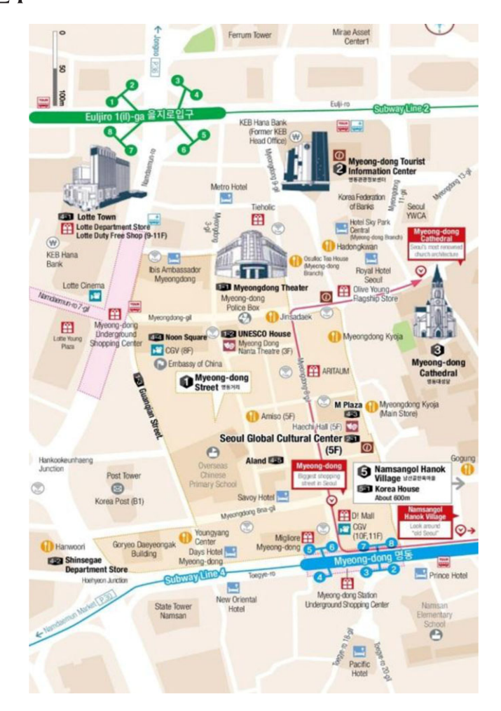
MAP 2 Map of Myeongdong<sup>3</sup> [Colour figure can be viewed at wileyonlinelibrary.com]

has a unique feature. Lawrence (2012) states that 'due to government regulations, most signs are written in Korean only' (p. 88). Tan and Tan (2015) also agree that 'explicit government effort accounts for the higher numbers of signs with English written in the Hangeul script' in Insadong (p. 73). They further report that 'script mixing is also most visible in the Insadong area. Romanized Korean is likely to take on a decorative or symbolic function as it is seemingly made accessible to foreigners but retaining its Korean meaning, which would not have made much sense to non-Korean speakers' (ibid.).