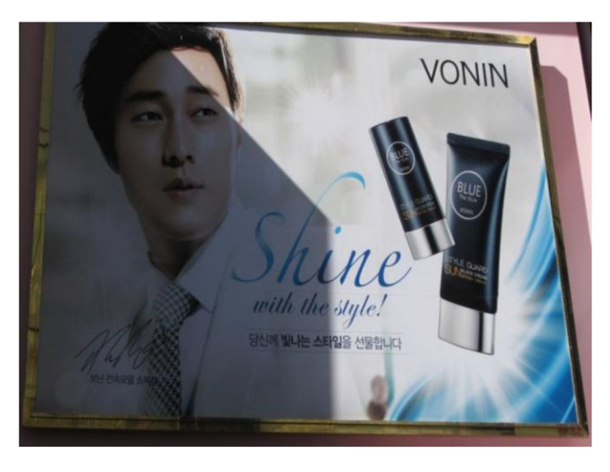
FIGURE 1 Sign advertising a sunblock lotion [Colour figure can be viewed at wileyonlinelibrary.com]