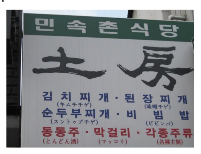
FIGURE 12 Korean restaurant sign featuring Sino Korean, Korean, and Japanese [Colour figure can be viewed at wileyonlinelibrary.com]