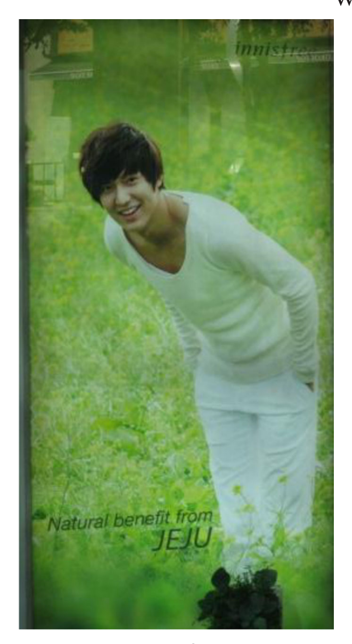
FIGURE 5 Cosmetics manufacture's green marketing sign [Colour figure can be viewed at wileyonlinelibrary.com]

the Korean equivalent. It can be inferred from the linguistic choices on the sign that this ice dessert is available in East Asian countries although their names differ from one country to another.