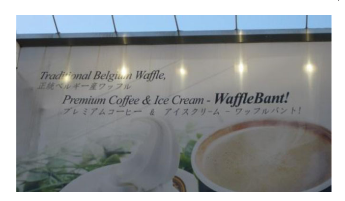
FIGURE 14 Breakfast café sign promoting its signature menu [Colour figure can be viewed at wileyonlinelibrary.com]