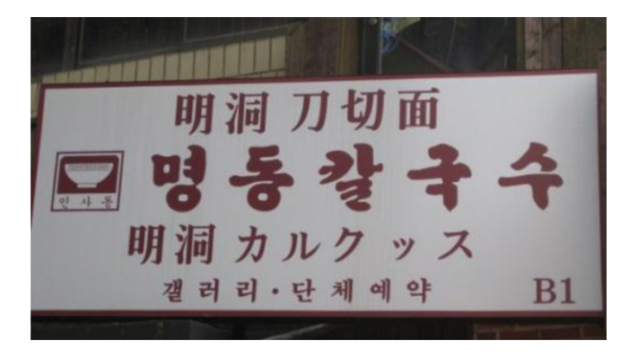
FIGURE 13 Restaurant sign specializing in handmade chopped noodles [Colour figure can be viewed at wileyonlinelibrary.com]

(Insadong), placed under the image of the noodle bowl, and 갤러리. 단체 예약 (kayleri. tanchey yeyyak, 'gallery group reservation'), meaning that they accept group reservations, including galleries, which are common in Insadong. The only English expression is 'B1' in the right bottom corner, indicating that the restaurant is located in the building's basement.