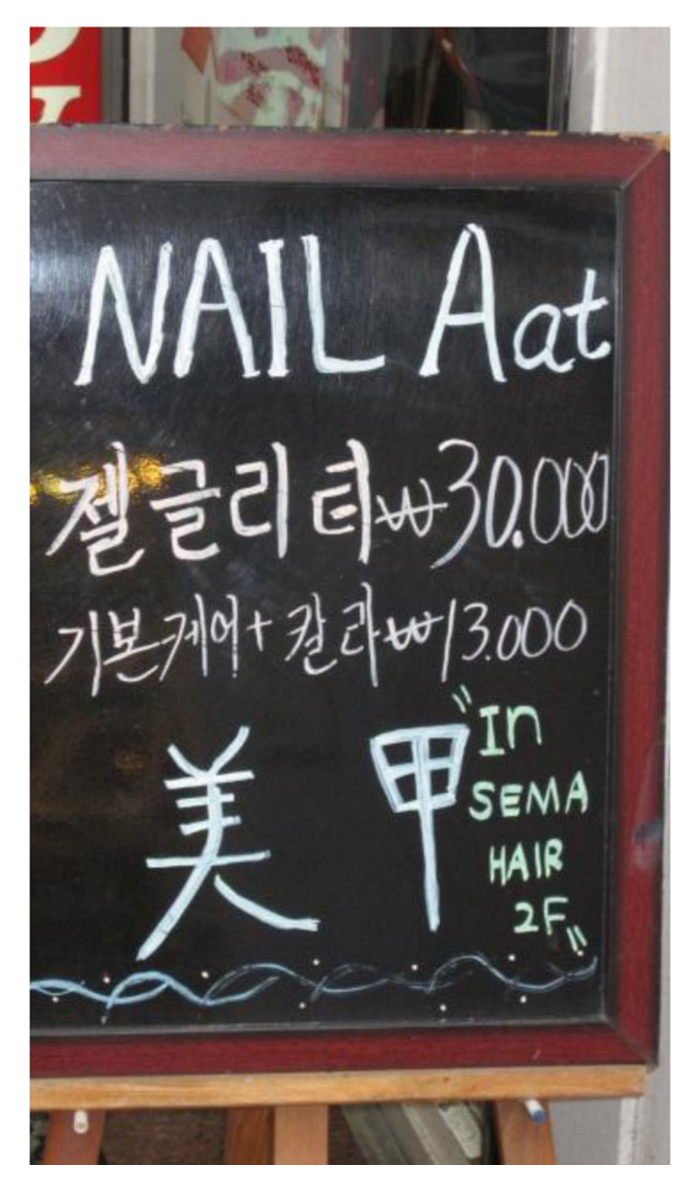
FIGURE 4 Sign advertising various nail art services [Colour figure can be viewed at wileyonlinelibrary.com]

Korean plum drink, Korean noodles, Korean meat) or home appliances for preparing Korean food (e.g., a specialized refrigerator for kimchi)' are advertised in Korean (p. 74). Lee (2006) argues that 'the noticeable absence of English in Korean commercials signifies tradition and not the construction of modernity' (p. 87). In Figure 6, no English is used. Moreover, the letters are written in a somewhat old-fashioned font called 'kwungsechey'. We can infer, based on the street vendor's linguistic choices, that he or she views their main customers as Koreans, especially older Koreans who would appreciate this traditional hard candy they used to taste when they were children. Stern (1990) discusses 'nostalgic typologies' linking the brand to 'a favorably recollected past' and 'childhood satisfaction' (p. 22).