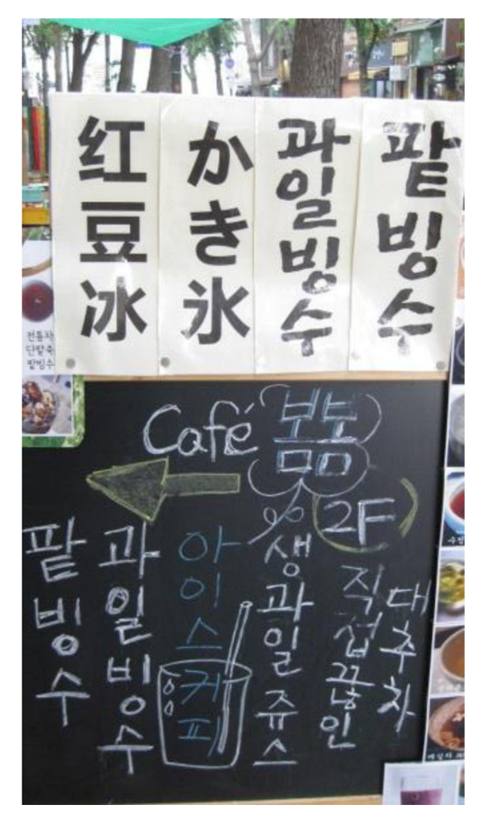
FIGURE 7 Multilingual café sign promoting an ice dessert [Colour figure can be viewed at wileyonlinelibrary.com]