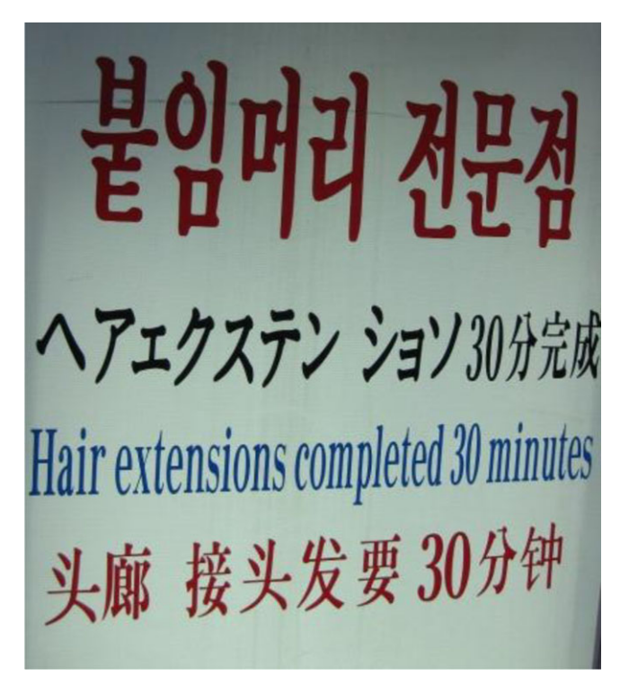
FIGURE 3 Multilingual sign about hair extensions [Colour figure can be viewed at wileyonlinelibrary.com]

known in China, which is why he is often dubbed Hallyu star ('The Korean Wave star'). The copy 'Natural benefit from JEJU' emphasizes organic ingredients used in this company's beauty products. Furthermore, the actor's white outfit and the green pasture in the background remind passersby and potential buyers of Jeju's clean and unpolluted nature, which in turn enhances the image of the company's commitment to using natural ingredients, such as herbs, flowers, and plants, in their products. In fact, the company is self-dubbed as 'Korea No. 1 natural brand' on its website and 'a naturalism-oriented cosmetics brand' (Wikipedia). According to a 2015 Research and Markets report, 'the South Korean market for natural & organic cosmetics is one of the fastest growing in Asia'. Revenues are increasing at double digits because of high consumer demand for natural and organic products. Johri and Sahasakmontri (1998) observe that the 'use of traditional cosmetics and toiletries manufactured from herbs and plant extracts has been popular in many Asian countries. However, green marketing of these products is rather recent' (p. 265). Almost 20 years after Johri and Sahasakmontri's article was published, 'green marketing' is now widely promoted, which is exemplified in Figure 5, as more consumers are environmentally-conscious.