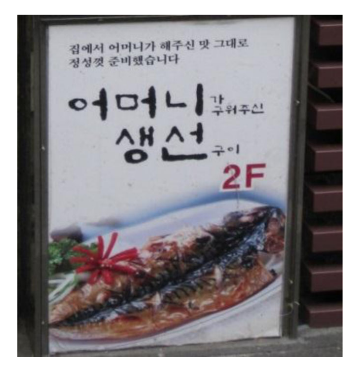
FIGURE 15 Grilled fish restaurant sign advertising home-style cooking [Colour figure can be viewed at wileyonlinelibrary.com]

cooked for me'). It is written in smaller print and only two keywords are selected and highlighted in the restaurant name, 어머니 (emeni, 'mother') and 생선 (sangsen, 'fish'). The name of the restaurant is placed in the center, and an additional description, or 'sales pitch', appears right above in smaller print, meaning 'we cook our fish with great care and dedication just like your mom would at home' (집에서 어머니가 해주신 맛그대로 정성껏 준비했습니다).