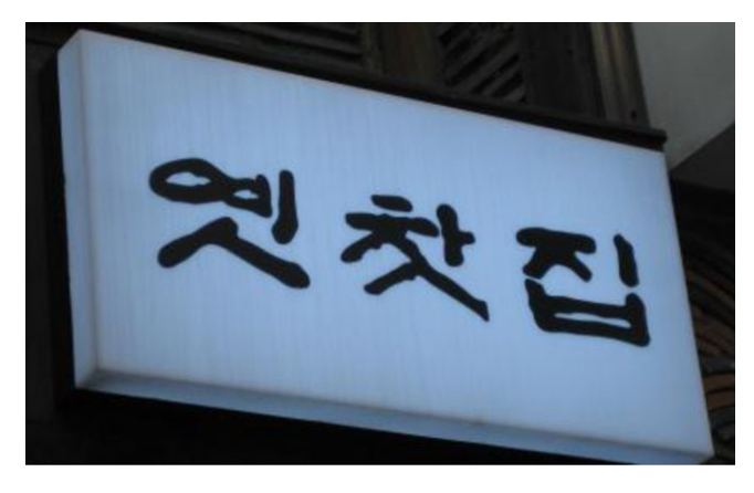
FIGURE 9 Traditional tea house sign [Colour figure can be viewed at wileyonlinelibrary.com]