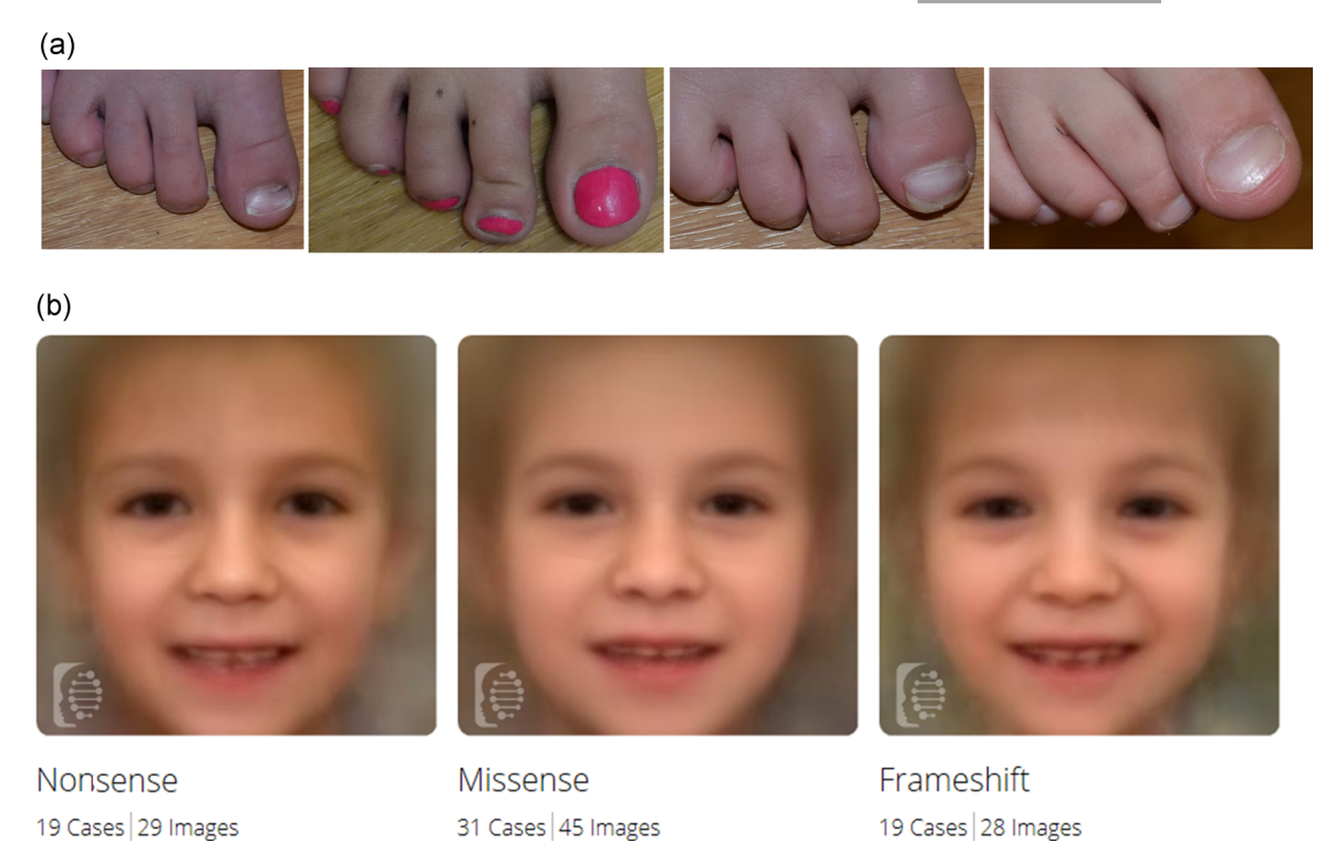
FIGURE 2 (a) Broad halluces from four different individuals. (b) Composite images of individuals with nonsense, missense, and frameshift variants. Across all three images a flat philtrum with thin vermillion of the upper lip can be recognized

Severe expressive language delay is common with 84.3% (102/ 121) of individuals older than 4 years of age having 10 or fewer words in their expressive vocabulary, with 42.1% (51/121) demonstrating completely absent verbal communication (Figure S3). Other areas of neurodevelopment can also be compromised as evidenced by an average age at the first steps of 25.5 months. Intellectual disability has been reported in several individuals old enough to undergo cognitive evaluations and often in the moderate to severe range (Zarate, Smith-Hicks et al. (2018)). Dental abnormalities are present in all individuals and include delayed development of the mandibular second bicuspids or the roots of the permanent teeth, severely rotated or malformed teeth, taurodontism, and multiple odontomas (Kikuiri et al., 2018; Scott et al., 2018). Behavioral difficulties, feeding issues, abnormal brain neuroimaging, low bone density, suggestive facial features, and cleft palate complete the characteristic phenotype of SAS (Table 3). Through previous reports and the evaluation of dozens of patients by at least a single examiner (Y.A.Z.), broad thumbs and/or halluces appear to be another distinctive feature, present in a third of individuals evaluated (16/ 47 = 34%), that could raise the clinical suspicion of this diagnosis (Figure 2a).