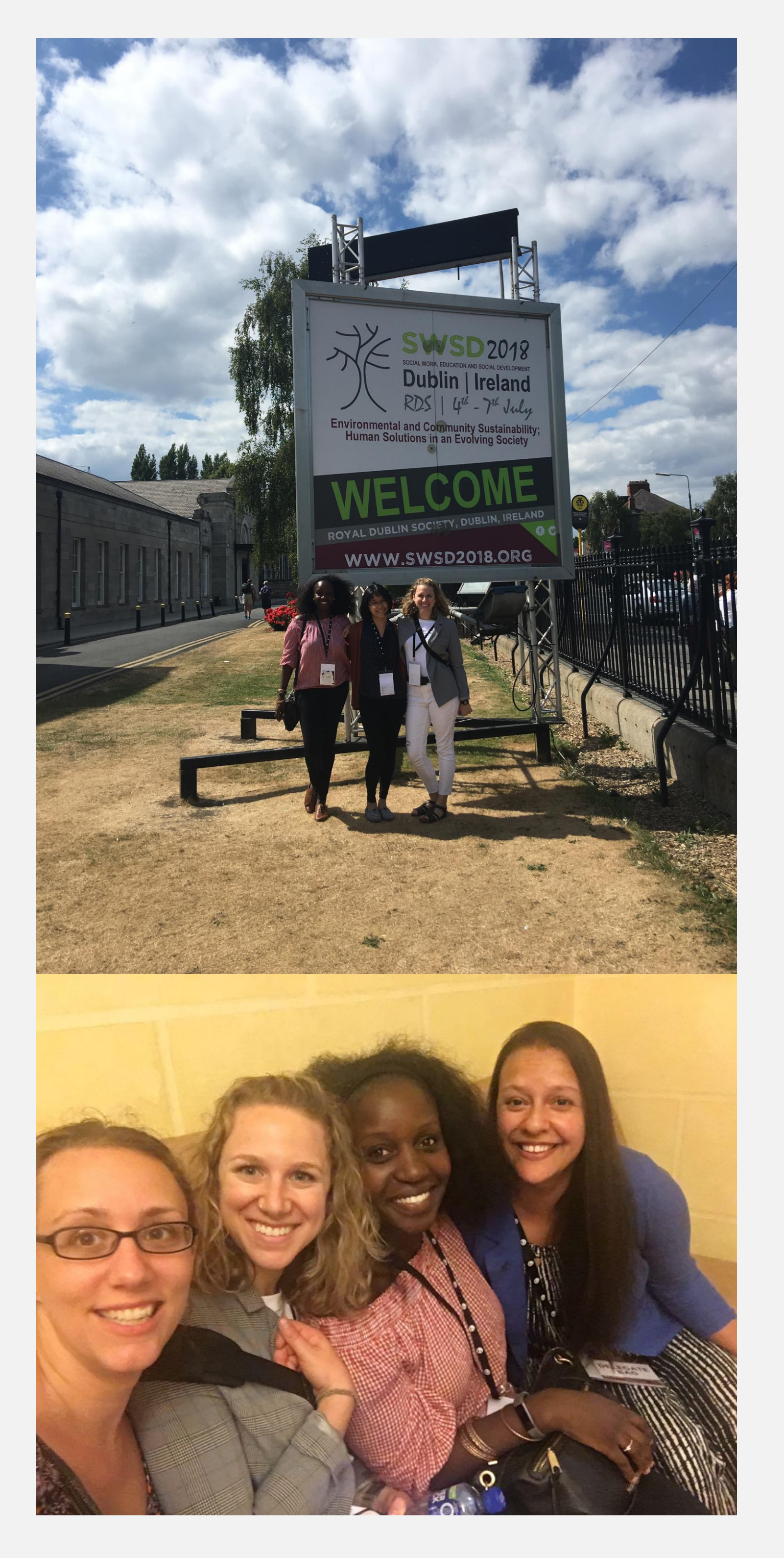
The photos here feature fellow UM SSW doctoral students at the conference and on a day trip to the Cliffs of Moher.