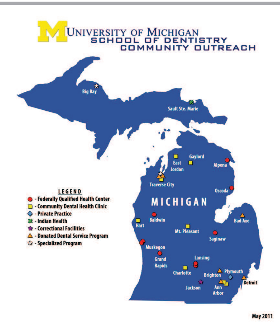
Figure 2. Map of the state of Michigan, showing the diverse types and locations of clinic partners in the UMSOD community-based dental education program

The success of the UMSOD community-based model is evident in the increased access to care in communities with partnering dental clinics, the improvement in students' clinical skills, and the impact on student education through exposure to the needs of underserved communities. Since the beginning of the program's expansion in 2000, the school has developed partnerships with twenty-seven clinics in the state of Michigan (Figure 2). The amount of time students spend in community clinics has increased from three weeks in 2000 to ten weeks in 2010. Since 2004, students have treated 58,652 patients