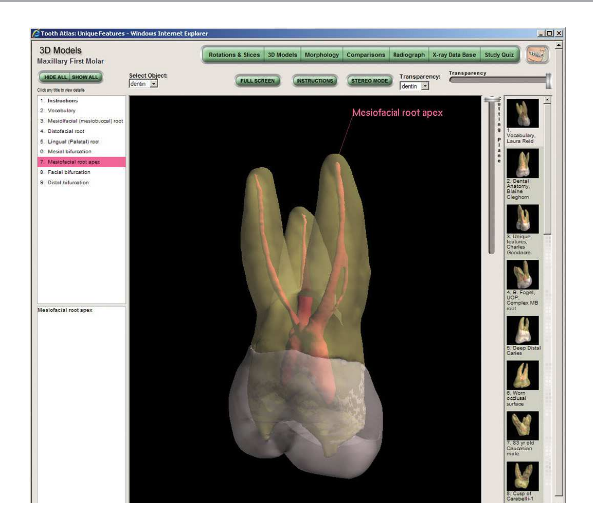
Figure 2. The Tooth Atlas 3D allows students to explore dental anatomy in three dimensions

system (VitalSource Technologies, Inc., Raleigh, NC; www.vitalsource.com) offered a library of textbooks that students could read on the computer, annotate, and cross-reference. However, one study<sup>40</sup> found that student satisfaction with the system was limited, mainly due to the effort required for reading extensive amounts of text on the computer and perceived high costs. The results were mirrored in a recent report,41 which showed that 75 percent of college students prefer hardcopy as opposed to etextbooks. However, the march towards e-books in general, and e-textbooks in particular, seems inexorable as an increasing amount of content is moved to digital format. Many other technologies, such as intelligent tutoring applications, 42 student response systems, 43 and lecture recording and broadcasting 44