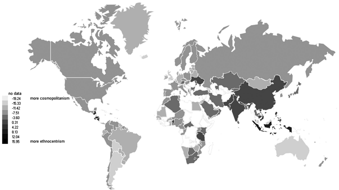
FIGURE 1 Consumer ethnocentrism versus cosmopolitanism in the world

Note: Numbers in parentheses are two-tailed p values.