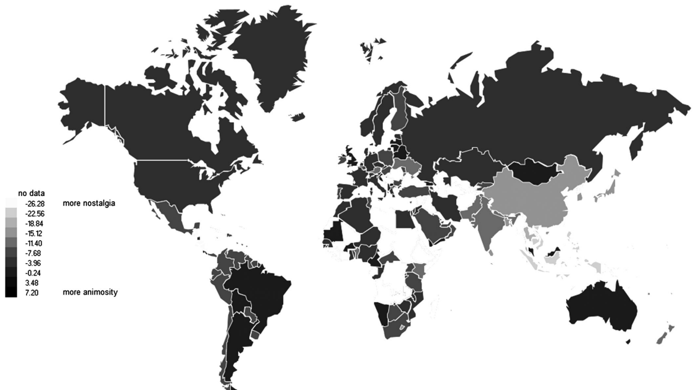
FIGURE 2 Simple average consumer animosity versus nostalgia in the world

Weighing the animosity versus nostalgia measures with partner countries increases animosity in 98 of 130 countries. The largest increases in animosity occur in Lesotho, and smaller European countries of Luxembourg, Belgium, Austria, Latvia, and Ireland. In contrast, the biggest increases in nostalgia are observed in the following countries: Panama, and several African countries such as Niger, Nigeria,