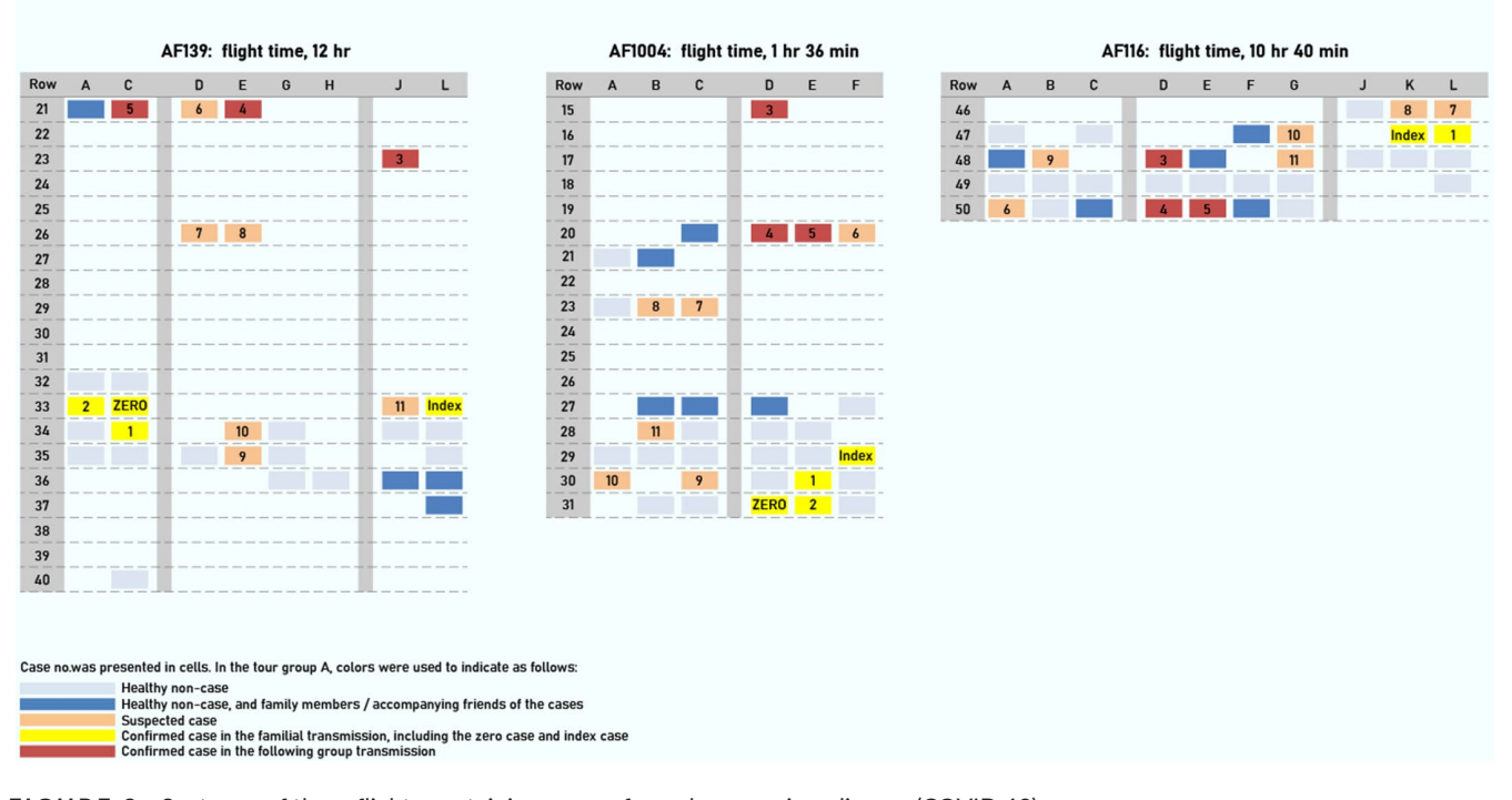
FIGURE 3 Seat map of three flights containing cases of novel coronavirus disease (COVID-19)

disabling the efficient transmission of SARS-CoV-2 may depend on social distance and personal protection, in addition to air conditioning system and air filters.