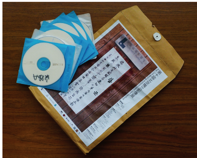
A festival in an envelope: the 2013 Beijing Independent Film Festival.

The hot spots of 2009 are gone. The financier who had bankrolled the archive and screenings at the Iberia gallery in Beijing’s 798 Art District decided it did matter that he couldn’t capitalize on documentary and video art, and sloughed off those activities. His collection, the China Independent Film Archive, went into exile—first in Hong Kong, and finally in Brussels, where it became one of the standing ruins. After many troubled years, the anthropological institute in Kunming that hosted Yunfest (the Yunnan Multi Culture Visual Festival) pulled its support; the festival’s programmers retreated to ethnographic work on music and other spheres of cultural production. May Fest was the modest event run by Wu Wenguang, who essentially inaugurated the independent cinema movement in China in the early 1990s. He discontinued his festival in 2014 when his CCD Workstation collective was forced to abandon its beautiful building in Beijing’s Caochangdi Art District and move to a village far outside of Beijing’s city limits. The reasons