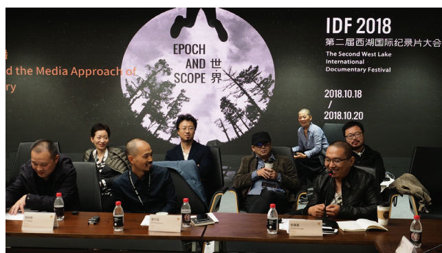
A forum at the 2018 West Lake International Documentary Festival.

Although Zhao Liang’s Behemoth was dropped by SIFF when it failed to pass censorship, his Guji de shengyin ( A Solitary Human Voice , 2018) was one of the highlights of West Lake. This short film on Chernobyl is a dry run for a feature project about nuclear-accident sites; he is currently shooting at Three Mile Island and Fukushima. The film consists of a set of quiet tableaux shot inside Chernobyl’s radioactive exclusion zone, slowly crosscutting between abandoned buildings and an old woman who refused to evacuate. Originally one of a small group of stubborn survivors, she is now the only one left alive. Sitting silently, lying in bed, she appears profoundly alone. Because she only sits, sighs, and sleeps, it feels as though her present existence is mainly spent dwelling in the past. Snippets of first-person narration are superimposed over beautifully composed images. A kind of inner monologue,