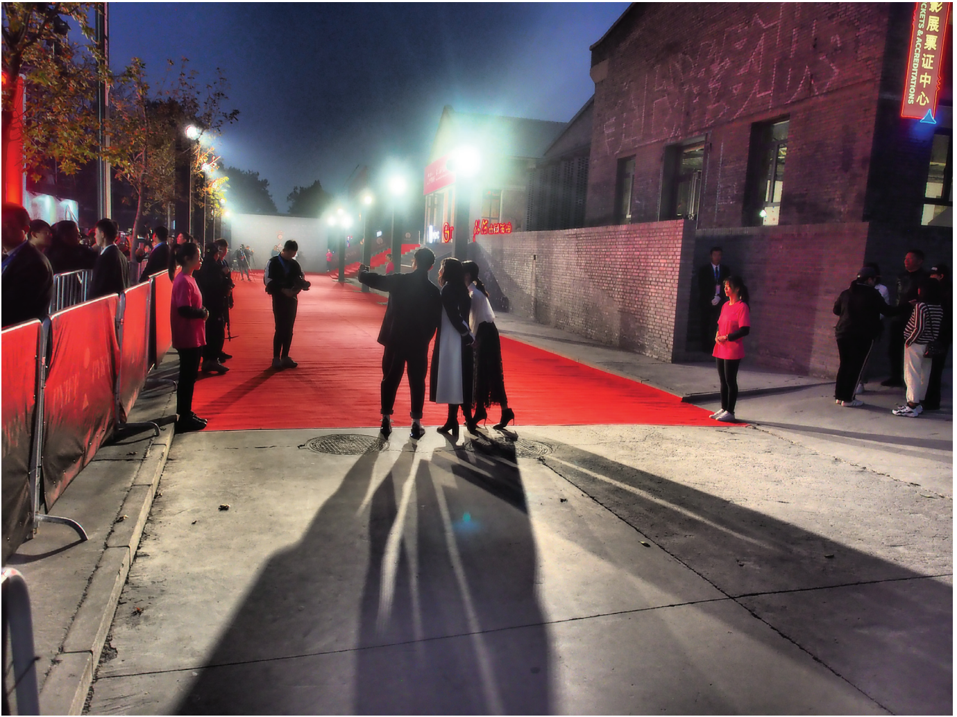
The spectacle of the red carpet at the Pingyao International Film Festival.

There is a disconnect between producers and audiences that Jia and company hope to ameliorate. On the ground at Pingyao, the logic behind Jia's perplexing moves makes sense. Pingyao inserts itself into an institutional space between SIFF/BIFF and the ruins of the previous indie festivals. Jia estimates that there are over fifty million potential audience members with an inclination to watch interesting, artful cinema. It is a huge number that could easily sustain what in most countries would be called the independent sector. But at the moment, there is a radical disconnect between these kinds of filmmakers and their potential audience. Jia and Müller are attempting not only to cultivate this new audience but also to address the puzzle of distribution in the wake of the failure of the Arthouse Alliance. 16 Each year, a small collection of films are carefully chosen and presented, in an attempt to leverage them into a broken distribution system that favors the popular film. This is a burgeoning film system awash in capital but suffering from a vacuum that Jia is cannily and admirably trying to fill. I went to