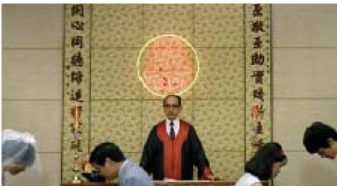
An unusual instance of symmetry in Hou's oeuvre, from A Summer at Grandpa's, 1984 (Fig. 4)

Hou usually used typefaces, with the most notable calligraphic title gracing Good Men, Good Women, 1995. (Fig. 3)