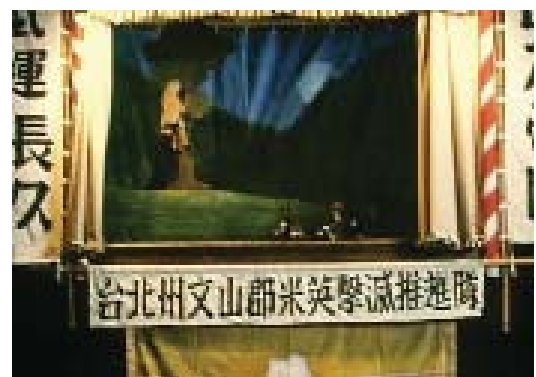
Two shots from The Puppetmaster , 1993. While most Chinese filmmakers snap to symmetrical composition whenever calligraphy enters the frame, Hou's approach is eclectic and unpredictable (left). An exception is the stage. (Fig. 5)

the priest, in synch. It is a scene that demands symmetry.