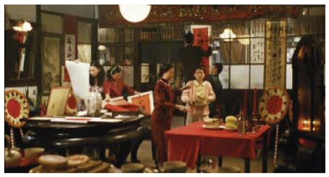
A City of Sadness, 1989 The first scene following the title – in an Altmanesque cacophony of action, six calligraphic scrolls adorn the walls in three rooms, and women are hand-inspecting two more. A vase, which will soon become the most prominent object in the film, sits on a table, hardly noticeable in all the action and visual clutter. (Fig. 1)

moving his camera forward and backward with only the occasional (and strategic) pan or track. Close-ups were rare and the long take standard. Shot-reverse shot figures are oddly staged, the few times he uses them.<sup>3</sup>