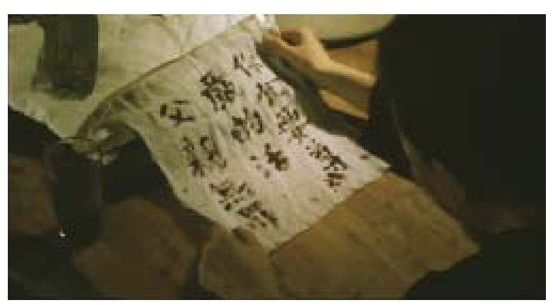
A City of Sadness