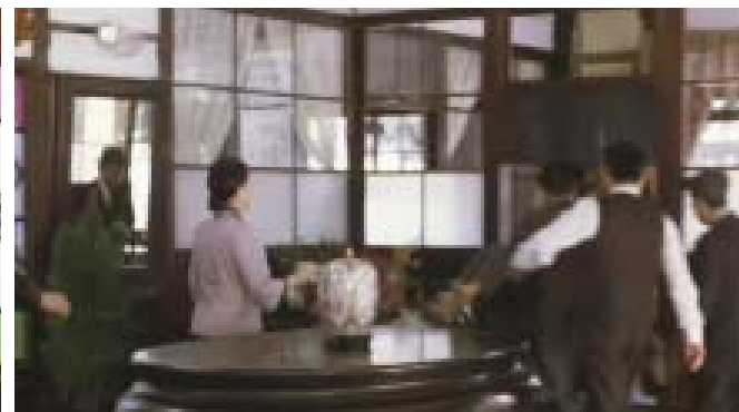
A City of Sadness. Late in the film, two central settings are finally connected by an economical and quite unusual pan. (Fig. 9)

action and visual clutter. Hou cuts to another room somewhere in the house where the patriarch sits at a table; two scroll paintings grace either side of a shrine in the back room, obscured by plants and yet more windows. A third and final cut takes us to another space with the vase and a striking stained glass wall. Above it, calligraphy on a wood plank identifies the name of the establishment - the Little Shanghai - and another work of calligraphy is half-visible in a back room. The vase returns now, suggesting the camera has tracked back to the first space, but jumped a clean forty-five degrees to the right. However, even the most scrupulous viewer probably requires multiple viewings to make sense of this space. Not until the second half of the film, after Hou has introduced a number of other rooms to the house, does he stitch it all together. This is the scene where the eldest daughter-in-law marches past the restaurant table, and the camera pans to reveal the second-brother brought into the shrine room