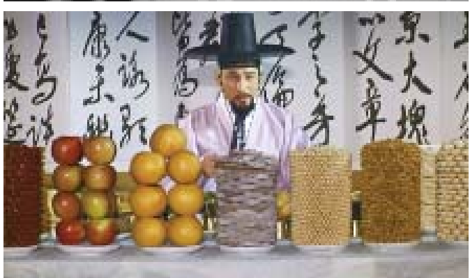
Calligraphy exerts a pressure on mise-en-scene in different ways for Korean, Japanese and Chinese filmmakers. Korean films often drape the background in calligraphy, Chinese filmmakers use symmetry, and Japanese shuttle such props to the edges. (Fig. 2)