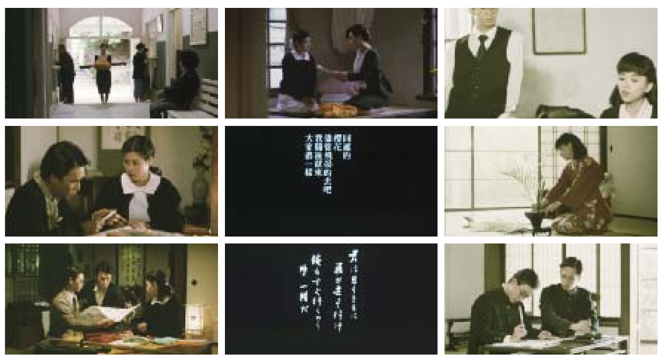
A City of Sadness