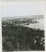
The big building to the left of the center is the Theater of the Summer Palace. 1933