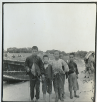
Kids all want their pictures taken here.