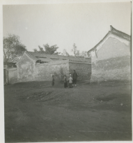
Street scene Peiping 1933