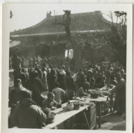
Scene in courtyard of temple. See the little boy eating