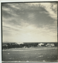
Our house to the extreme left.

211 East Cliff, Peitaino Beach Hopei, China 6/10 to 9/5 -1934.