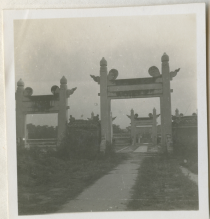
At the Temple of Earth north of Peiping. 1933