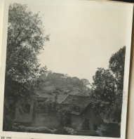
The "Temple of Heaven" from our back porch. Hengchow. 1934