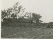
110 A country home north of Peiping. 1933

The end of a very long journey. The basket is in this.