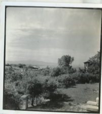
From our front porch looking north.