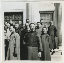
"Dearest" front center. 1933