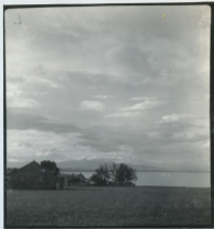
Another scene looking north from near our house.