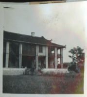
Chenchow Hospital, 1934