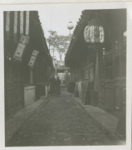
Street scene Peiping