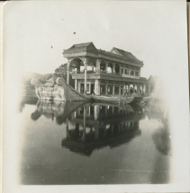
Marble Boat, the pride and joy of the Empress Dowager. Summer Palace. 1933