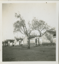
Street scene Peiping, 1933