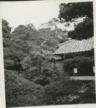
A view in the Golden Pavilion at Kyoto Japan. Sept. 1933