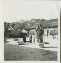
The Empress Dowager's residence, Summer Palace Peiping. 1933