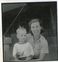
out of their hats ready for mar- ket. See the nice donkeys they have here.