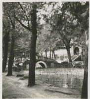
Summer Palace. 1933