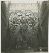
Bronze Buddha in Lama Temple 1933