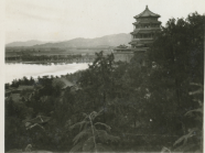
Summer Palace with the Western Hills in distance. 1933