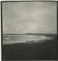
Our swimming beach on a stormy day. The raft was washed ashore. Peitaiho.