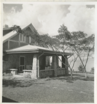
South porch of Chandler house