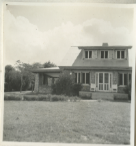
Front view Chandler House at Peitaiho, We slept on porch on other side,