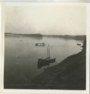
Siang River near Hengchow. R.C.L. 1934