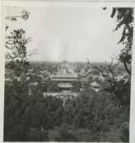
Taken from an artificial hill of the Forbidden City looking north. The North gate is in the distance.