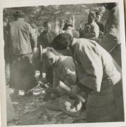
Kowtowing and burning incense at temple. 1933