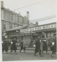
Part of a funeral Procession Peiping. 1933