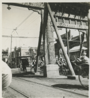
Street scene Peiping, 1933