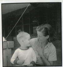
Miss All want their pictures taken here.