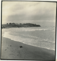
Light House Point about a mile south of us.