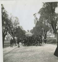
The end of a very long funeral procession. The casket is in this. 1933