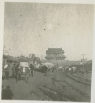
East gate near the College of Chinese Studies. Peiping 1933