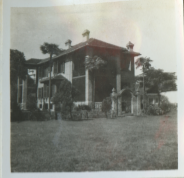
Our home in Hengchow, 1934