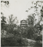
Summer Palace 1933