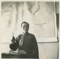
"Dearest" or Chang Hsien sheng. Taken in class room. 2895