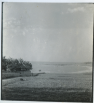
The beach where we go swimming.