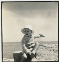
Question: Where are Grandma and Grandpa? Ans. Over there! In Santa Ana and Long Beach. Note: Over there is due east.