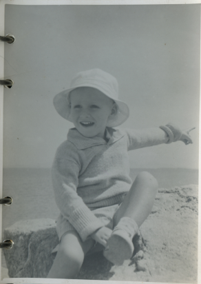
On our way home from the beach.