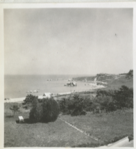
View from the front room at Mrs. Chandler's