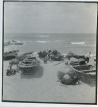
Fishermen taking shrimps etc out of their nets ready for market. See the nice donkeys they have here.