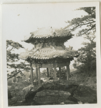
Ruins of an old shrine in the older portion of the Summer palace. 1933