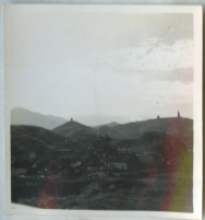
From Chenchow hospital front porch. East pagoda to rt. with sentinel towers to left. . R.C.L. 1934