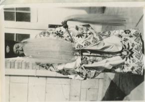
Left. Another lady Teacher

211 East Cliff, Peitaino Beach Hopei, China 6/10 to 9/5 -1934.