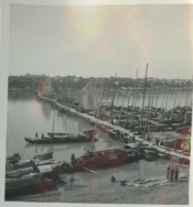
Boats were forced to build a bridge for the soldiers to cross Siang river at Hengchow, received rice for food only during the time the soldiers were crossing. R.C.L. 1934 Nov.