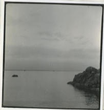
Two junks in the distance.