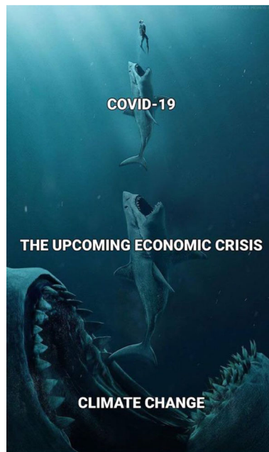
FIGURE 1 Social media meme framing global crises in health, economy and climate as interconnected.

they are perceived the message as from their ingroup or outgroup (Fielding et al., 2020). Indeed, climate emergency framing to a large extent has been embraced by progressive sides of politics more than conservative, so emergency framing may be more effective at mobilizing progressives than engaging conservatives, who may require other approaches.