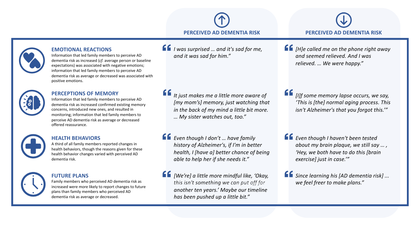
FIGURE 2 Representative quotes from family members who learned a cognitively unimpaired older adult's amyloid-β PET scan result and a personalized estimate of risk of developing Alzheimer's disease (AD) dementia by the age of 85 based on age, race, sex, and family history

individuals had to have a CDR of 0 (i.e., a score indicating normal cognition and functioning) to participate in REVEAL-SCAN. A "not elevated" amyloid- \beta PET scan result offered reassurance and led to reframing of those baseline concerns. For instance, a husband who had "attributed memory lapses ... to the onset of Alzheimer's, the early stages" reinterpreted them as "normal aging." By comparison, learning an "elevated" amyloid- \beta PET scan result served to validate baseline concerns. One woman stated it was "not surprising" her sister was "a little off" in light of what she learned.