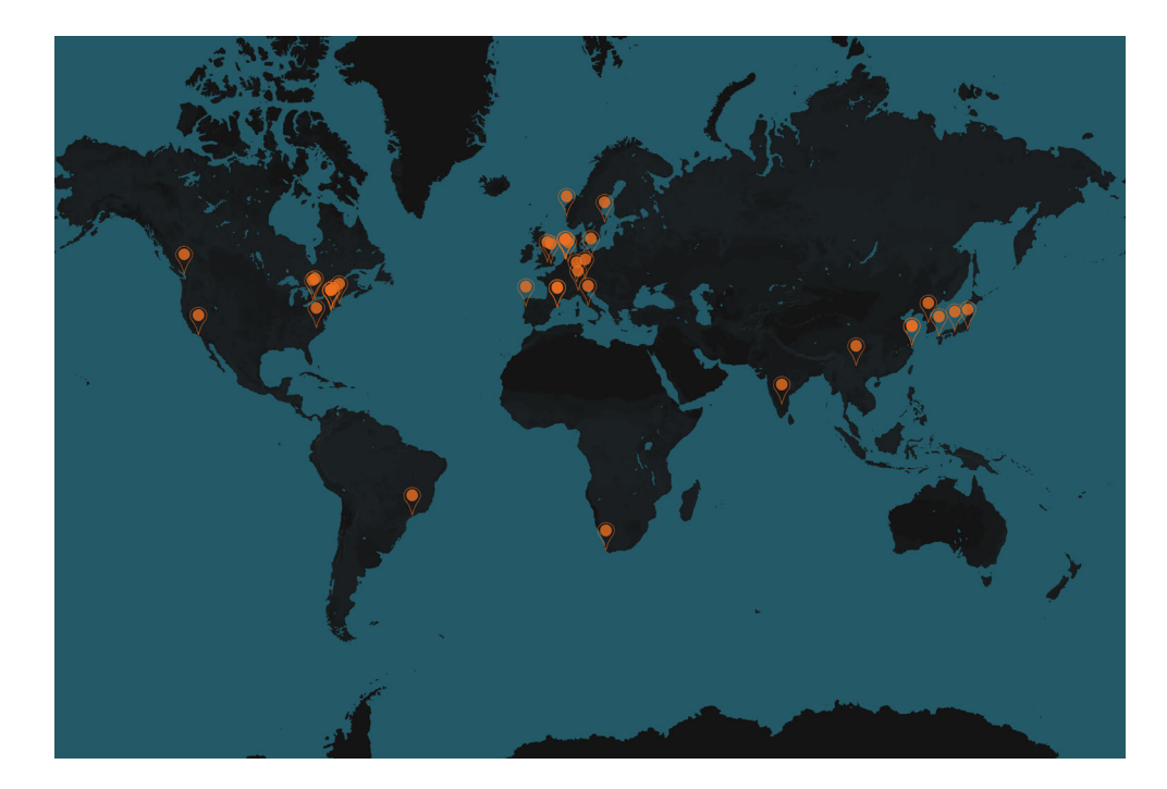
FIGURE 1 World map showing the 34 institutes participating in the ENIGMA-OCD consortium

cross-sectional structural MRI data a mega-analysis performs better than a meta-analysis (lower standard errors and narrower confidence intervals), and in a multi-center study with moderate variation between cohorts, a linear mixed-effects random-intercept megaanalytical framework seems to lead to the best model fit (Boedhoe et al., 2019).