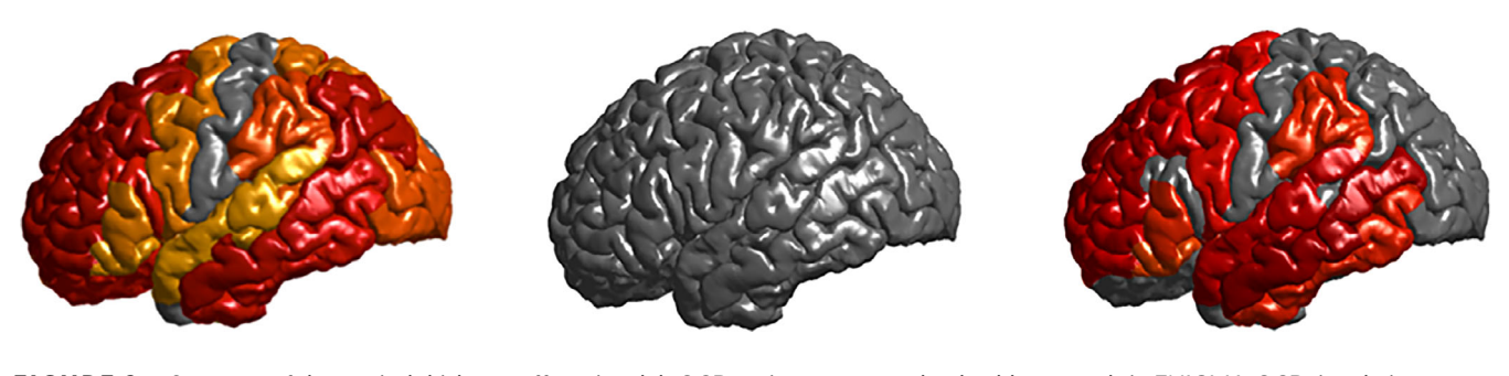
FIGURE 3 Summary of the cortical thickness effects in adult OCD patients compared to healthy controls in ENIGMA-OCD, in relation to medication status (based on Boedhoe et al., 2018 Am J Psychiatry). Negative effect sizes d (ranging from light orange d = -0.05 to dark red d = -0.15) indicate thinner cortex in OCD compared to controls

medicated OCD (n=646) vs unmed. OCD (n=831)