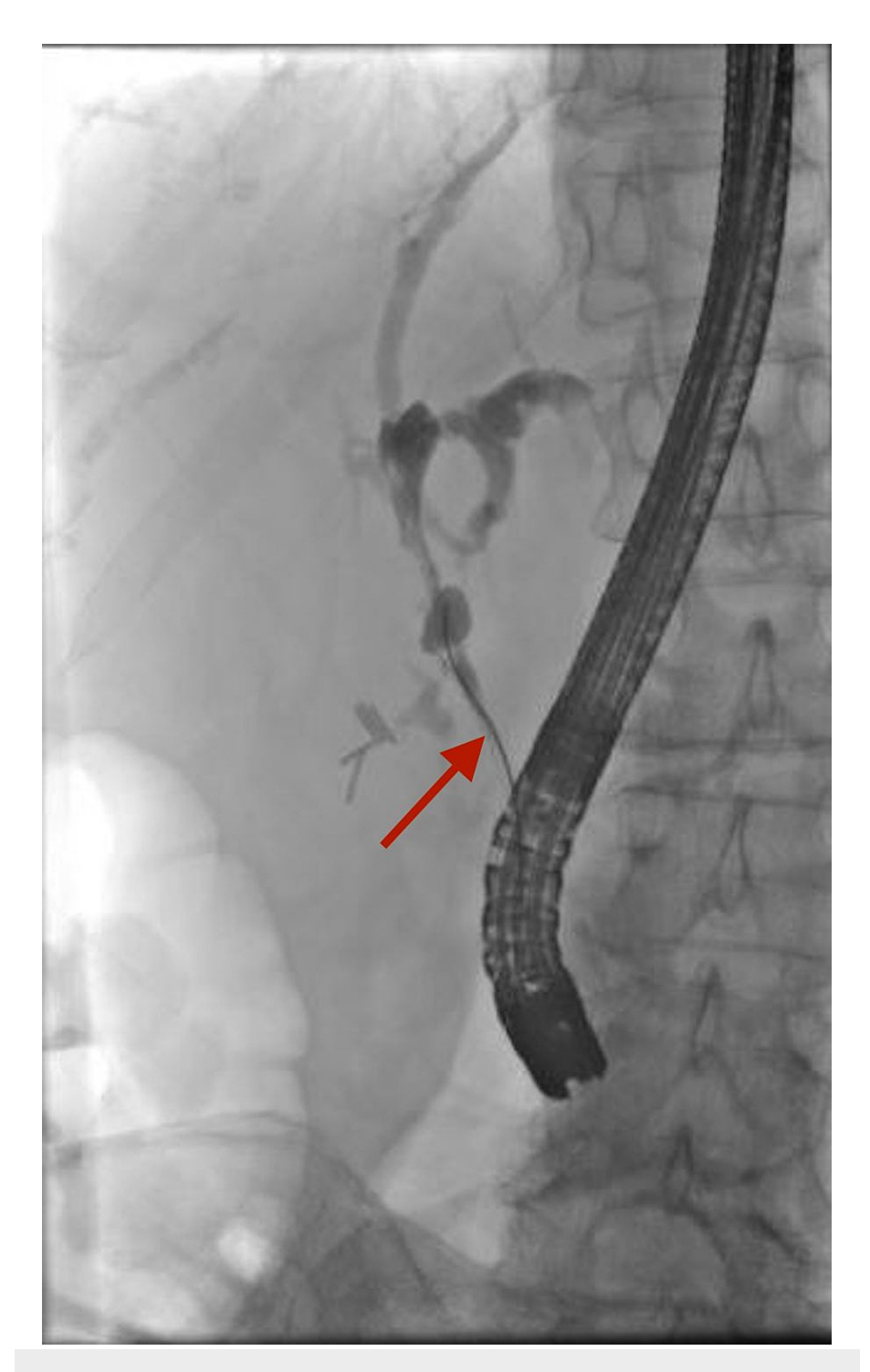
FIGURE 3: Endoscopic retrograde cholangiopancreatography (ERCP) showing a severe extrahepatic bile duct stricture (red arrow) with left filing defects due to sludge

Common bile duct brush cytology showed no malignant cells. CA19-9 was negative. The patient was switched to minocycline as per sensitivity and was discharged home to finish a course of 14 days of minocycline.