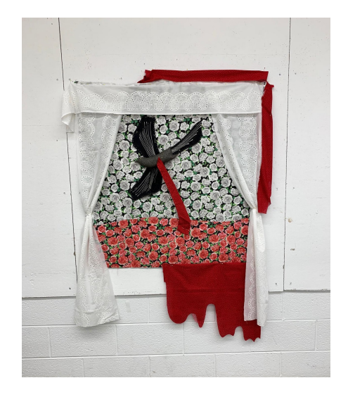
Figure 40. Combining materials and finding composition.