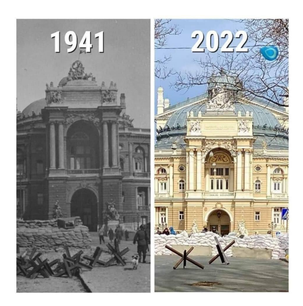
Figure 7. Kyiv Opera Theater in 1941 and 2022.

In 2022, during the first weeks and months of the war there were plenty of images circulated online that made parallels with the current war in Ukraine and World War 2. In one of them the Kyiv Opera Theater photographed in 2022 from the same point as in 1941, and two pictures are placed next to each other (Figure 7). The similarity of the images is striking: the anti-tank barricades are situated at the same place in the front of the building that survived the Nazi's occupation of Kyiv. This image says to us that history repeats itself unfortunately in the worst of ways. The only thing different here is the date and the presence of color in the contemporary photo. In my work I also use a color as a marker of the current moment in contrast to the black and white photographs from past wars.