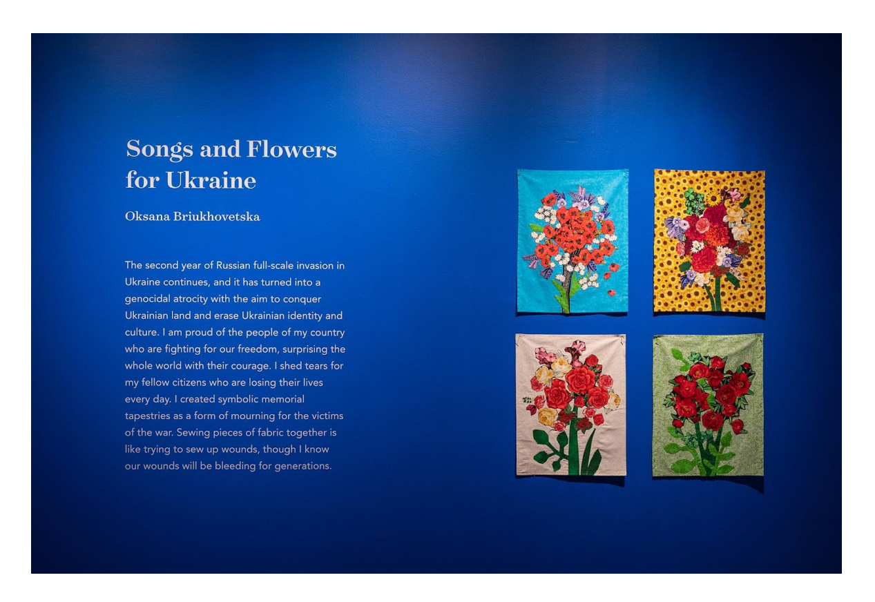
Figure 49. The wall text and Bouquets series. Songs and Flowers for Ukraine. Stamps Gallery.

The four pieces of the Bouquets series are displayed near the wall text (Figure 49). The space between them forms the cross, and is also reminiscent of a window. Each tapestry represents a bouquet of flowers that are typical in Ukraine. They aim to glorify and celebrate Ukraine as well as grieve as the flowers could be bouquets that people bring to the graves of those killed, but they could also be bouquets to bring to Ukrainian soldiers who are liberating Ukrainian cities and villages from Russian invasion.