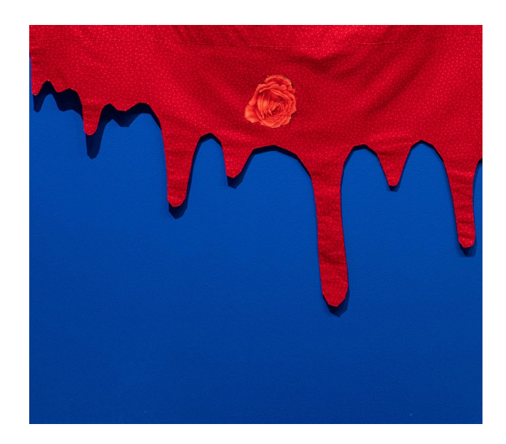
Figure 46. Songs and Flowers for Ukraine. Blood. Detail.

All four tapestries are bleeding except the central one, which refers to the past. But still, the color of its frame reminds us of a dark color of dried blood. Between the bloody frames and the images, there is another thin frame made from blue and yellow ribbons which are the colors of the Ukrainian flag.