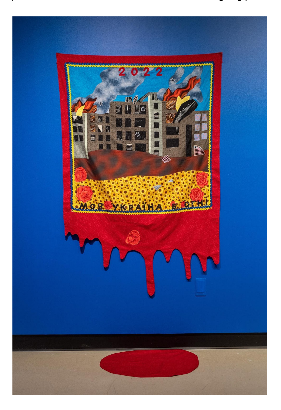
Figure 10. Oksana Briukhovetska. My Ukraine in Flame? Tapestry from the Songs and Flowers of Ukraine series. Textile collage. 2022.

I connect the experiences of the generation of my grandparents to the present day fellow citizens in my tapestry which displays burning buildings rupturing landscape, with colors that reference the Ukrainian flag in the blue sky and yellow sunflower fields. The words in Ukrainian "Моя Україна в огні" - "My Ukraine in Flames" - are written across the tapestry at the bottom, and at the top I display the date – 2022 (Figure 10), which references that this is today's war even though the current war started in the Eastern part of Ukraine in 2014, and war has been an ongoing part of Ukraine's history.