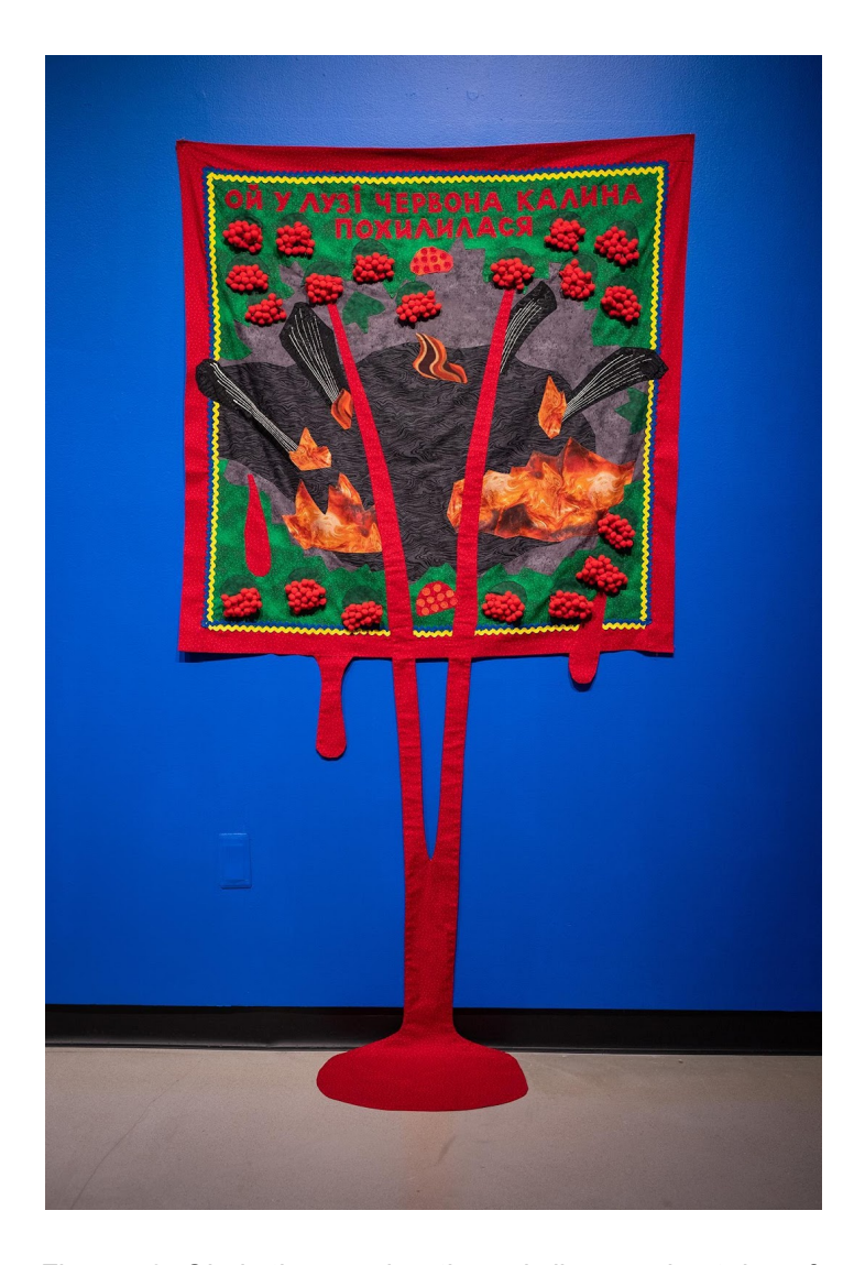
Figure 48. Oh, in the meadow the red viburnum bent down from Songs and Flowers for Ukraine.

Oh, in the meadow the red viburnum bent down Our glorious Ukraine is grieving But we will raise that red viburnum And we will cheer up our glorious Ukraine!