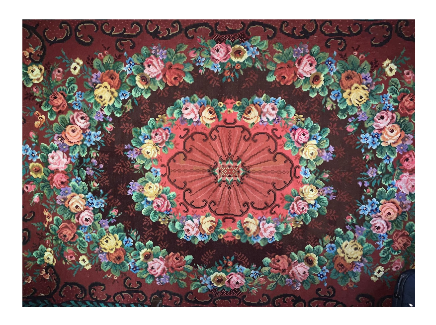
Figure 14. Embroidered wall carpet by my grandma Valentyna Briukhovetska. Cherkasy, Ukraine, 1980s.

During the Soviet times women of my grandmother's generation had limited resources for their craft-making practices that were also practices of care. My grandmother often produced knitted clothing and embroidered tapestries using recycled threads. She used to untangle old sweaters or hats to extract threads from them, and it is there that she found the elements for her colorful textile palette. In her house in Cherkasy, she kept sacks with balls of threads of multiple colors. For large scale carpets my grandma used big skeins of industrial threads of many colors that she obtained somehow from the synthetic fiber factory where she worked for a period of time before retirement. She embroidered her biggest carpets over a year or more, and I remember her immersed in this process between other housework in the meditative atmosphere of calmness and warmness. She taught me to knit and to embroider. I remember my joy when I first knitted a small yellow scarf for my favorite toy, a small yellow dog. Later I made many clothes for my doll Natalia. My grandmother's carpets do not represent traditional Ukrainian embroidery, however. They are examples of urban folk culture of the late Soviet times. That said, their value for me was not so much in their canon or style as the manual labor and time put into their creation, and my grandma's ideas of beauty and her passion while performing this work.