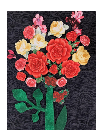
Figure 34. The single elements of my colleges.

Also, the patterns of fabrics can change their meanings. This is very visible in the examples of Chilean Arpilleras. For example, in contemporary Arpilleras, made by women of Santiago that I have met, pieces of fabric with black and white "leopard" or "zebra" patterns often are used to depict mountains with snow (Figure 35). Using a small piece limits the pattern and changes its ability to be recognized, or rather, something new can be recognized in it.