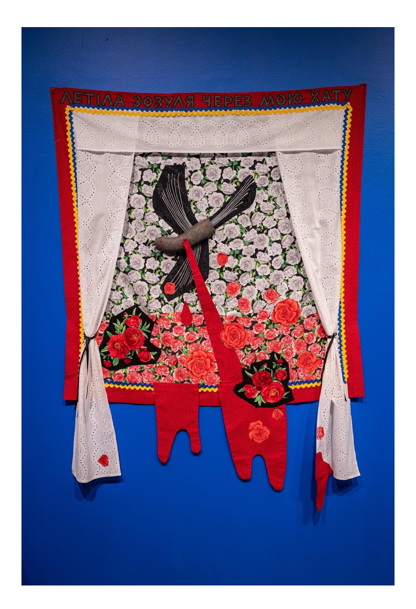
Figure 47. A cuckoo flew through my house from Songs and Flowers for Ukraine.

I used the symbol of a bird-mother as a representation of a motherland. In my image, she is suffering and bleeding from being injured while flying through the window. (Figure 47). The entity which always helps, now needs help, and needs to be rescued. The red frame displays the first line of the song in Ukrainian, "Летіла зозуля через мою хату."