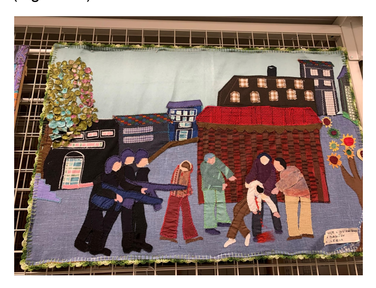
Figure 28. Arpillera. Santiago, Museum of Memory and Human Rights.

Craft as a dissenting political position of resistance is also a key feature of Chilean Arpilleras. During the Pinochet dictatorship in Chile in 1970-80s textile collages called Arpilleras became a tool of storytelling about brutality of military regime in the country (Figure 28).