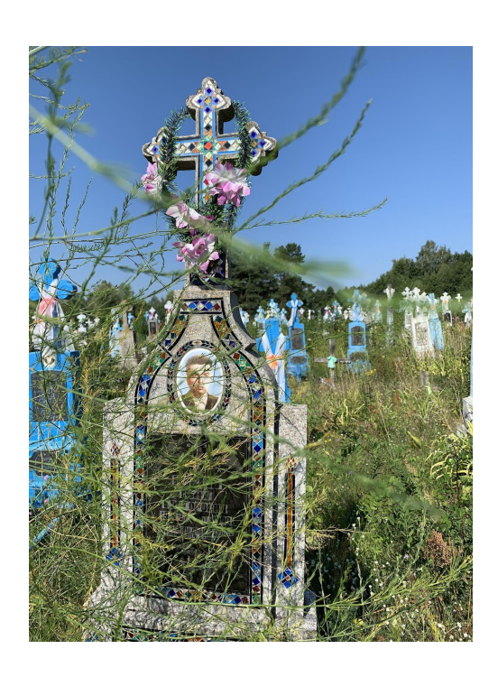
Figure 2. The headstone on the grave of my grandfather, Ivan Kysil. Installed in the 1990s. Volyn region, Ukraine.

Usually cemeteries are colorful in Ukraine. These photographs show the burials in the backyard of a residential building in Irpin, Ukraine in March 2022 (Figure 1), and a photo of the tomb my grandfather Ivan, arranged in the early 1990s which is at the cemetery in the Volyn region in Ukraine (Figure 2). Comparing these two images makes it easy to see the difference between the arrangements for death in peaceful time and during the time of war.