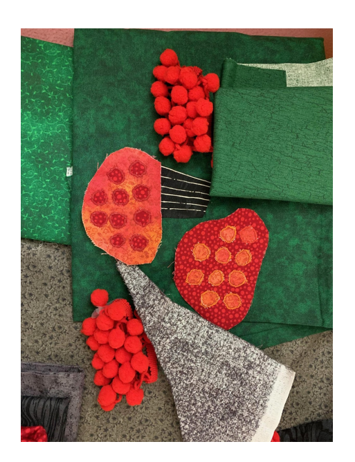
Figure 39. Cutting elements from fabrics.

My tapestries also include collage in text and printed photographs, which also makes them look like posters. They hold multiple references - to books, songs, intellectual questions. Such compositions also are reminiscent of hand-made albums I created as a child. I wrote the texts of my favorite songs into albums and decorated pages with my own drawings as well as with glued images cut from postcards or magazines. During that era postcards with images of flowers were very popular, people would buy them in post-offices and send them via mail for birthdays or other holidays. As a result people usually received many such postcards in their homes that could be recycled for other creative purposes. I cut flowers in a similar way from fabrics. Extracted from an endless repetitive design, they became a reminiscence of nostalgic postcards from the time of my childhood.