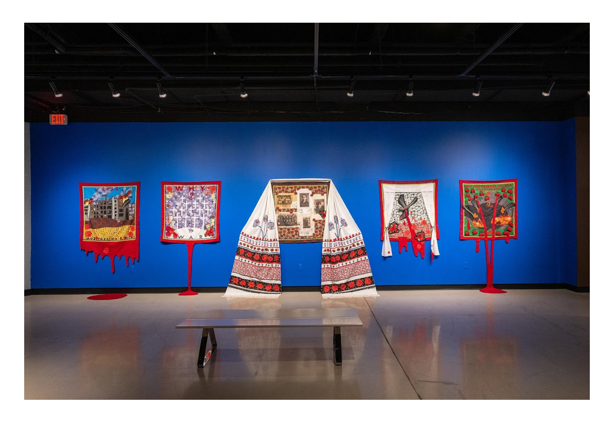
Figure 45. Songs and Flowers for Ukraine. 2022-23. Stamps Gallery, Ann Arbor, MI.

I use a bloody frame to enhance the urgency and necessity of my images to be confronted (Figure 46). By letting the blood spill onto the floor I emphasize the state of many bodies in Ukraine which are on the front lines and the blood symbolizes how Ukraine is bleeding and calling for help and support. The tapestry "My Ukraine in Flames" forms a puddle of blood on the floor; the blood from the cemetery on "Why War?" trickles to the floor; the blood from the injured body of a mother-cuckoo flows through the window to the imagined interiors - maybe the interiors of our minds; and the juice of the red viburnum berries, the symbol of Ukraine, turns into blood and spills on the floor as well.