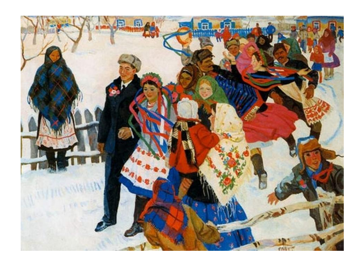
Figure 12. Tetiana Yablonska. Wedding. 1963.