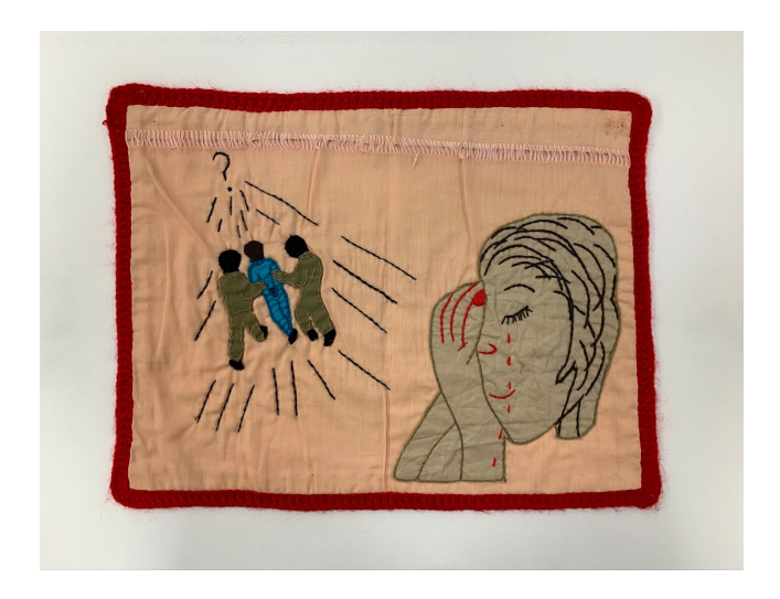
Figure 29. Arpillera, 1977. Santiago, Museum of Memory and Human Rights.

It was not possible to do so using words as censorship led to fear and silence. In these conditions women began telling their testimonies through textiles. While making collages from the scraps of fabrics they documented the stories of their family members being detained, tortured and disappeared (Figure 29, 30) and of their lives spent in poverty and uncertainty.