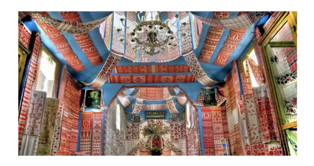
Figure 15. Embroidered towels in Orthodox Christian church.