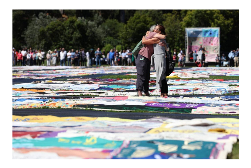
Figure 5. People embrace on June 11, 2022 near the panels of the AIDS Memorial Quilt in Robin Williams Meadow in San Francisco's Golden Gate Park.<sup>25</sup>

The size of each separate piece of AIDS Quilt corresponded to the size of the human body and grave. The pieces were later connected into a huge installation. The AIDS quilt is typically exhibited outside and horizontally on the ground in order to reference a sense of a cemetery to the people walking inside the installation (Figure 5).