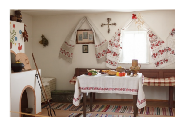
Figure 16. Embroidered towels in the traditional Ukrainian interior of a village house.

The tradition of Ukrainian embroidery is very rich and its ornaments differ depending on the region in Ukraine, and also of historical periods. Katya Zabelski also discusses how, during the Maidan revolution of 2013-14, traditional Ukrainian embroidered shirts called vyshyvankas "became extremely popular and are now a part of daily fashion, despite the garment's history of marginalization." In Ukraine the Vyshyvanka Day was established in May. On that day people wear traditional shirts to express their belonging to Ukraine, and this gesture became even more politicized during the time of war. The elements of patterns of Ukrainian embroidery have become symbolic and are still being referenced today in many anti-war posters and internet memes.