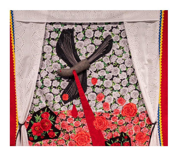
Figure 41. The Cuckoo Flew Through My House. Detail. 2022.

missile attacks using war-time jargon: they would say, "it flew to this street." These multiple meanings of flying resonate with the uncertainty and anxiety of the war time, when to admire the view from the window could provoke a death.