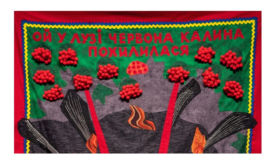
Figure 33. Text in Ukrainian on the tapestry which is the first line of the song. From the Songs and Flowers for Ukraine series. Detail. 2023.

language, but the compositions also include words and phrases. These words are not descriptive, but provide a reference around which visual image is structured: words from songs; an appropriated title from a novel; date; a question about why war is possible spread over a cemetery (Figure 33).