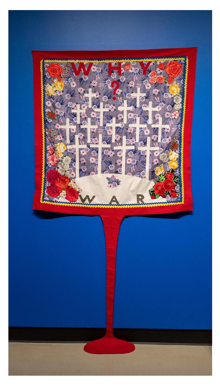
Figure 6. Oksana Briukhovetska. Why War? Tapestry from the Songs and Flowers of Ukraine series. Textile collage. 2022.