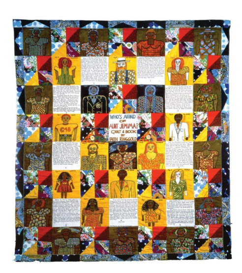
Figure 27. Faith Ringgold, Who's Afraid of Aunt Jemima? 1983, acrylic on canvas, dyed, painted and pieced fabric.

American artist Faith Ringgold is known for making quilts combined with painting techniques. She painted on top of her quilts as well as enriched them with text (Figure 27). Using quilt as a vernacular African-American craft she addressed issues of Black history and power alongside the history of American racism. Her works are a combination of visuality and storytelling and they elevate quilts beyond the decorative craft form at the same time perpetuating it as Black cultural tradition. She was also an active participant of the feminist movement in the 1970s, protesting against racism and sexism in the art world and demanding access to the galleries and museums for Black women artists. Her art was tied with political struggle.