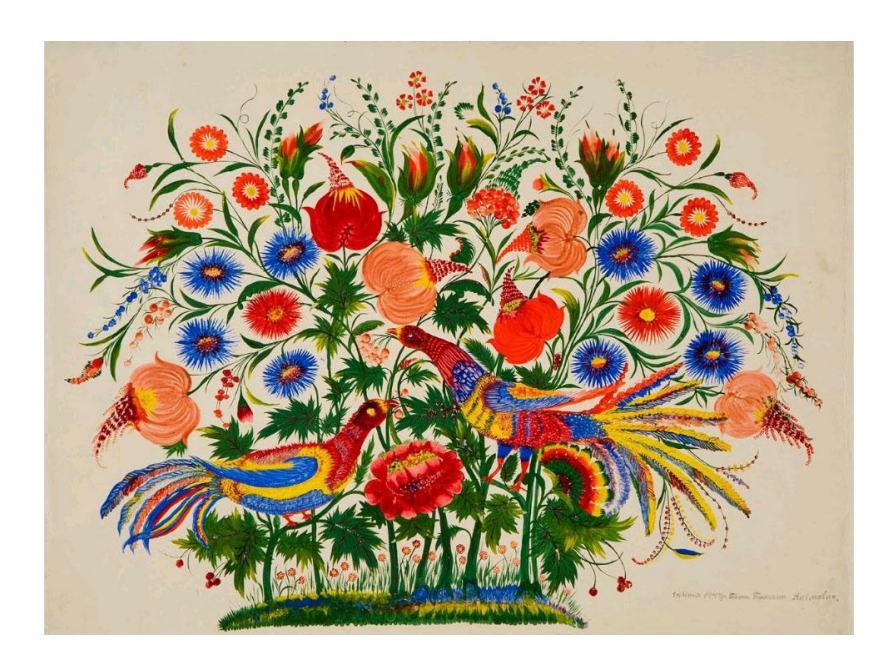
Figure 20. Tetiana Pata. Two peacocks. Painting on paper. 1949<sup>38</sup>

Looking at these paintings one could think that the life of Ukrainians was happy and carefree. This could be assumed because of the sincerity in the admiration of the beauty, sophisticated aesthetics, exquisite technique that can be seen in these works, which are all performed by inhabitants of the villages who worked hard in the land, went through difficulties and challenges such as authoritarian purges, mass starvation, poverty, and the Second World War. Considering these historical circumstances, it becomes clear that this art played a huge spiritual role for the community. Creating the depictions of beautiful flowers, artists healed themselves and brought healing to their community.