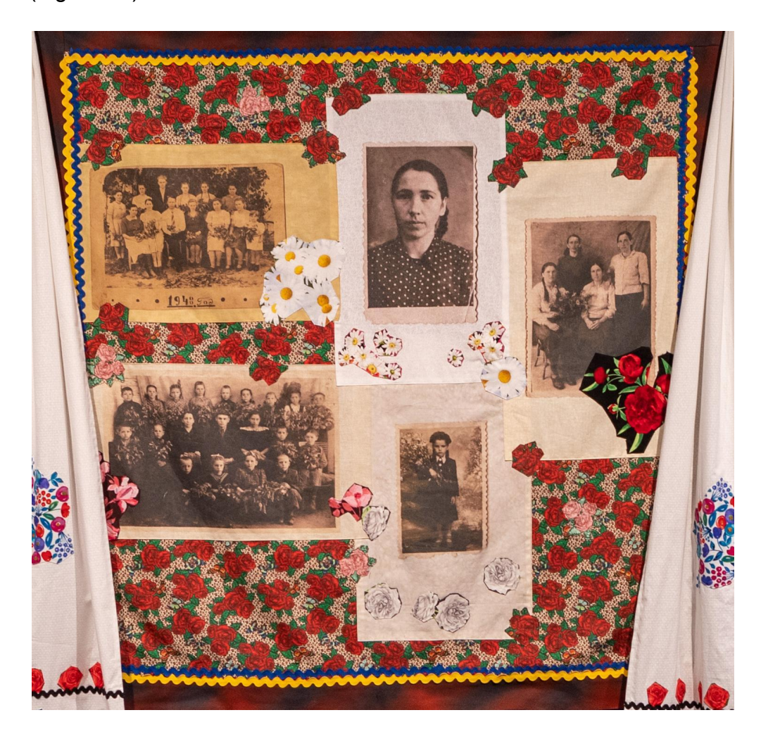
Figure 43. Family Altar, from Songs and Flowers for Ukraine. Detail.

them to express their memory, love and respect. I reconstructed such an altar using a textile medium. The background for the photographs makes use of a floral fabric that could be associated with wall paper, but the flowers from it invade the photo images (Figure 43).