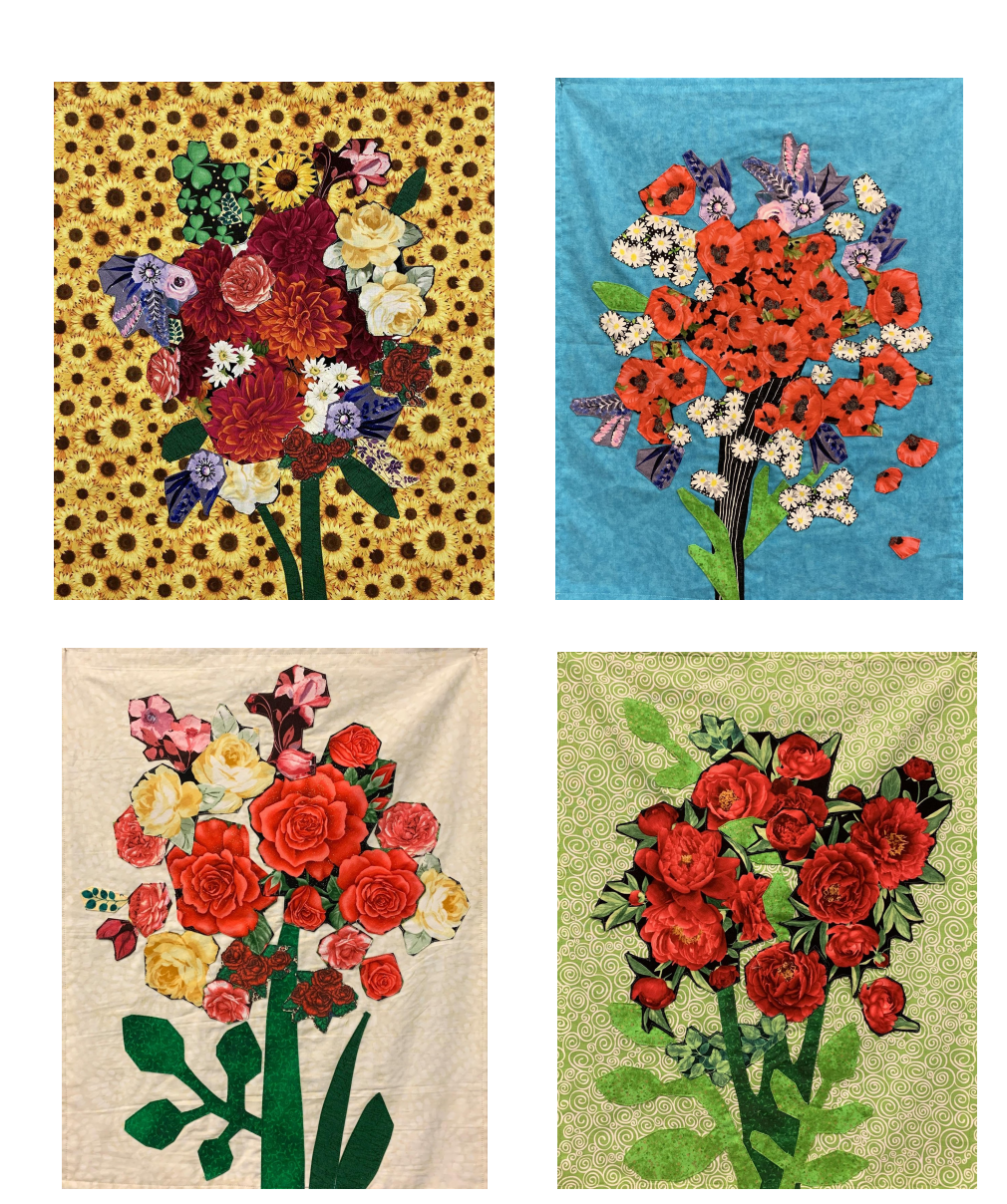
Figure 24. Oksana Briukhovetska. Bouquets from the Songs and Flowers of Ukraine series. Textile collage. 2022.