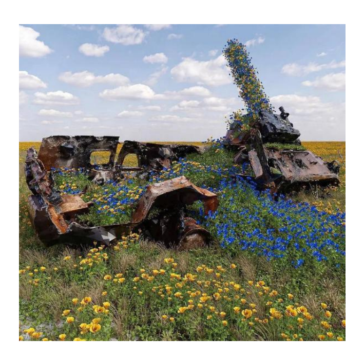
Figure 21.

But floral motifs have always found a rich expression in traditional Ukrainian embroidery and also in decorative painting. The known flower motif painting style Petrykivka is named after the village in which it originated around the 18th century in the Dnipro region of Ukraine. The rural amateur artists decorated the walls of the village houses with floral ornamentation, household items like boxes in which people stored their goods, and even icons. The significant feature of such paintings alongside the richness and beauty of floral images is its special brush technique. Later in the 19th century Petrykivka style was transferred also to paper. In the 20th century this style became popular in mass souvenir production and has undergone some standardization, and artists' individual styles became less distinctive, as items of mass production were decorated in one standard manner. But at the same time, there were artists in the region whose individuality reveals itself in their particular works. They established their own schools and taught Petrykivka painting to the younger generation. Tetiana Pata is remembered as a strong artist and founder of the Petrykivka school of painting, but she developed her own original style using the knowledge of painting traditions of her grandmother. In her work Two peacocks, birds and flowers merge into one visual harmonious symphony (Figure 20).