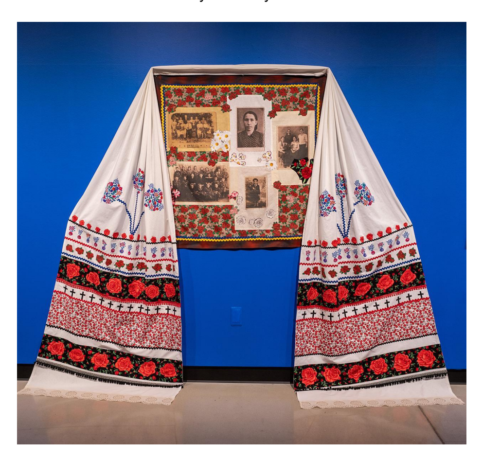
Figure 17. Oksana Briukhovetska. Family Altar Tapestry from the Songs and Flowers of Ukraine series. Textile collage. 2023.

When I created the ornaments for my "embroidered towel" I was reflecting on the Ukrainian landscape, in which plants and graves are as interconnected as life and death. The row of crosses on each part of the towel is a continuation of the cemetery image at the "Why War?" tapestry. Red roses representing blood and grief are present throughout the whole series. Then, under the lines of crosses there are the rows of plants and flowers. Both functions of the soil as a site of burial and of always emerging new life are connected in symbolic symbiosis.