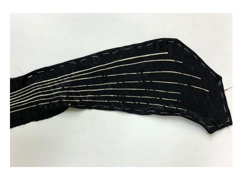
Figure 38. Fragments of my three different colleges that use the same element for different functional meanings.

I cut fabric into small elements and then I create my image from them like a mosaic (Figure 39). They contribute their colors and patterns into new images. Also, fabrics possess patterns, which provide a possibility of communication with each other. Combining them I put them into the conversations with each other that reminds me of playing music or singing together. If one imagines each pattern as a separate voice, their gathering brings to life a chorus of voices.