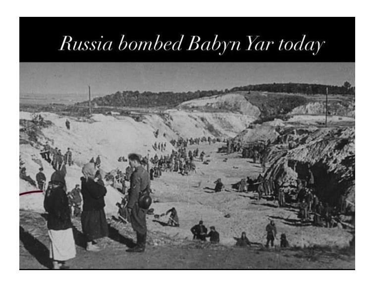
Figure 8. Russia bombed Babyn Yar today.

On the 1st of March, 2022, the Russian missile strike that aimed to target the Kyiv TV tower reached the site of the Holocaust mass murdering in Kyiv in the Babyn Yar ravine. That day Ukrainian artist Nikita Kadan posted a black and white photograph from Wikipedia's article in which the people are covering a mass grave after the massacre in the Babyn Yar in October 1941 (Figure 8). On the top of the image is a note posted on March 1, 2022, "Russia bombed Babyn Yar today." What happened that day - "today" - was not only an absurd repetition of the bombing the city of Kyiv, but the sacrilege of targeting those who already are victims a second time.