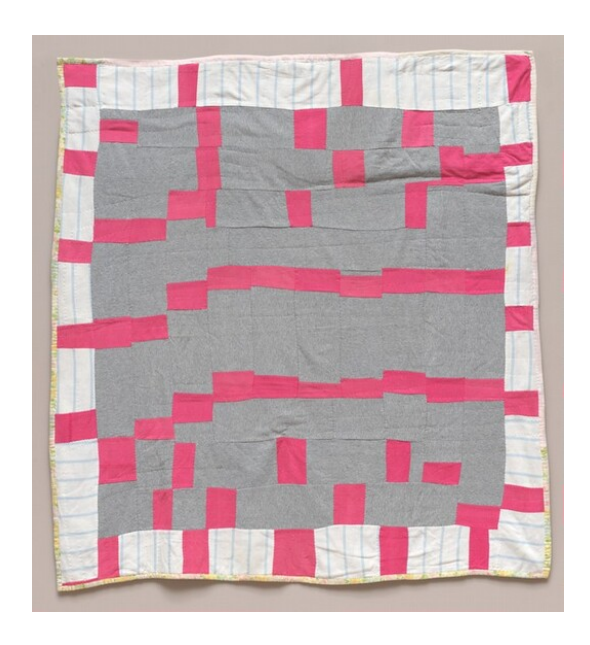
Figure 26. Missouri Pettway, 1900 – 1981, Path through the Woods , 1971, polyester knit, National Gallery of Art, Washington

American artist Faith Ringgold is known for making quilts combined with painting techniques. She painted on top of her quilts as well as enriched them with text (Figure 27). Using quilt as a vernacular African-American craft she addressed issues of Black history and power alongside the history of American racism. Her works are a combination of visuality and storytelling and they elevate quilts beyond the decorative craft form at the same time perpetuating it as Black cultural tradition. She was also an active participant of the feminist movement in the 1970s, protesting against racism and sexism in the art world and demanding access to the galleries and museums for Black women artists. Her art was tied with political struggle.