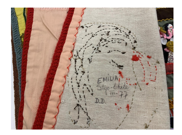
Figure 31. The backside of Arpillera, 1977. Santiago, Museum of Memory and Human Rights.

sometimes, but not always were signed by the woman who made it (Figure 31). All this communicated their vulnerability as well as their democratic spirit.