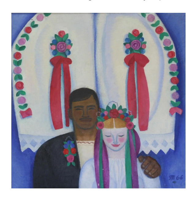
Figure 19. Tetiana Yablonska. Young couple. 1964.

This blue background can also be seen behind the young couple in the painting by Tetiana Yablonska of 1964 (Figure 19). This inspired me to also choose a similar blue color to be a background for my tapestries at the gallery.