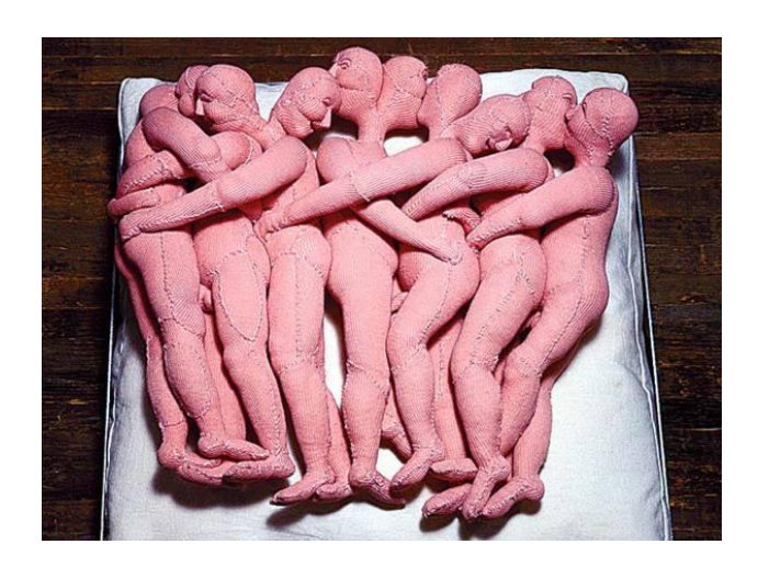
Figure 4. Louis Bourgeois. Seven in Bed. 2001.

The sculptural composition of Louis Bourgeois's Seven in Bed (Figure 4) could be interpreted from multiple perspectives. From the context of war, the "bed" could be transformed into the idea of the last refuge, and numerous bodies could be read as bodies in the mass grave, or the bodies that were sent to their deaths in mass scale.