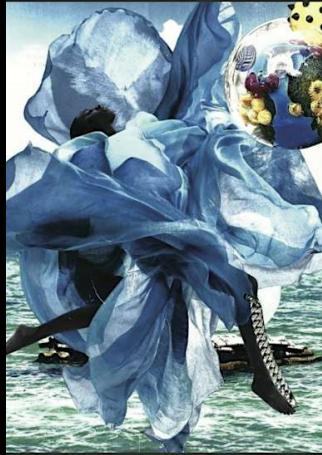
The Black is Hot / Air Walks Mixed Media Collage Soraya Jean-Louis, 2021