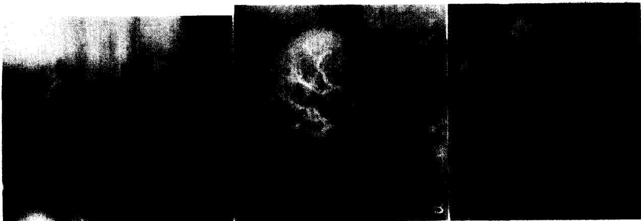
FIGURE 1. (A) Nephrotomogram showing defect in right renal pelvis and mass in lower pole of left kidney. (B) Arteriogram showing small arterial vessels supplying mass in right renal pelvis. (C) Vascular mass in lower pole of left kidney.

Because of a lack of facilities for hemodialysis, should this need arise, the patient was transferred to the University of Michigan. Upon arrival at our Center physical examination was unremarkable. Complete blood count revealed