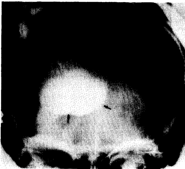
Fig. 2. Anteroposterior film of the metrizamide in a large cystic structure (arrows) located in the region of the right lateral ventricle and crossing the midline.