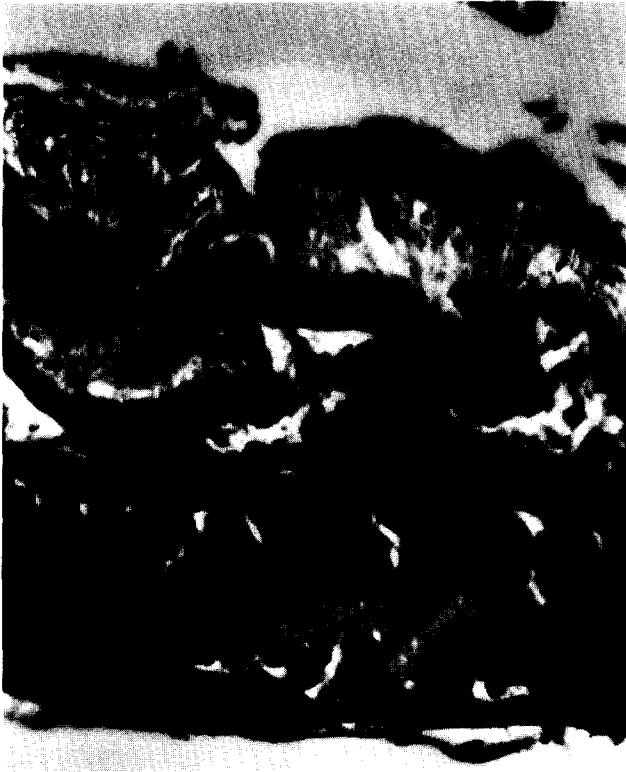
Fig. 5. Photomicrograph of specimen of cyst wall shows thin fibrous connective tissue membrane with a thin lining of columnar epithelium.

showed a large thin-walled cystic cavity originating from otherwise normal choroid plexus. The cyst wall was a thin fibrous membrane lined with low columnar epithelium. The wall contained no evidence of glial elements or malignant changes.