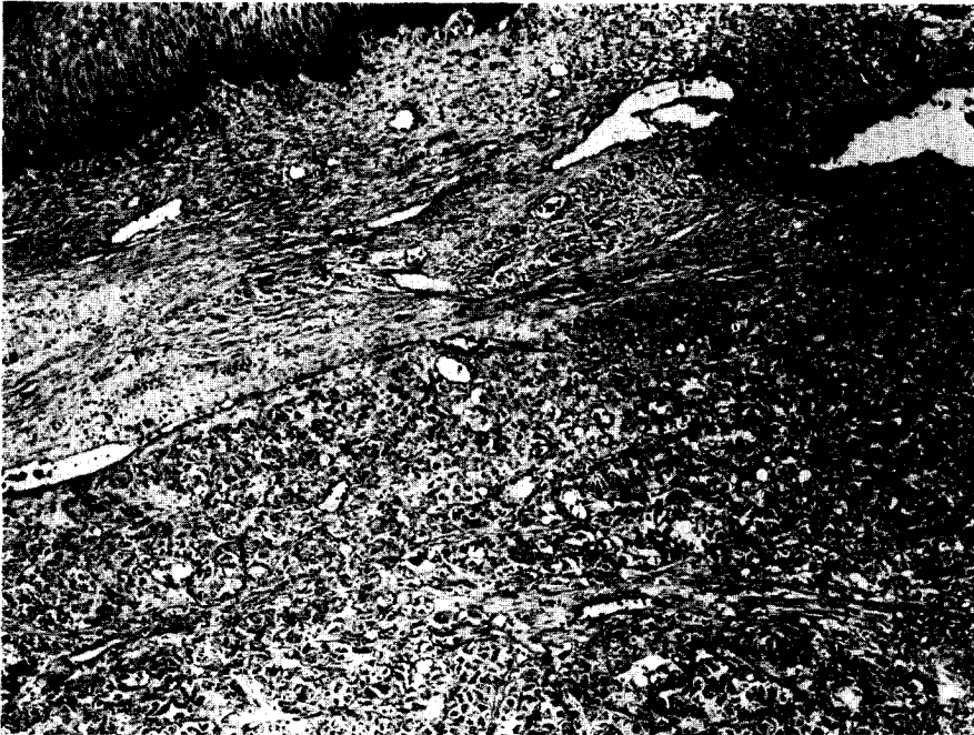
FIG. 1. The circumscribed border of the tumor is seen in this field. The adjacent cervical stroma appears compressed. (Hematoxylin and Eosin, \times 50 ).