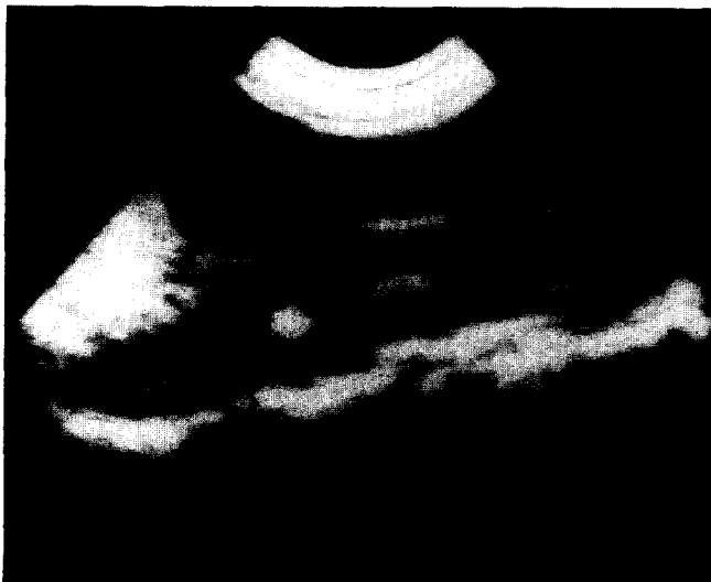
Figure 3. Intraoperative spinal sonography (sagittal view). Dorsal and ventral surfaces of the dura mater (small white arrows), anterior epidural mass (large white arrow), and posterior border of the vertebral bodies (open black arrow) are demonstrated. The ultrasonogram clearly demonstrates (1) the dorsal dural surface, (2) posterior displacement of a "sonographically normal" spinal cord with a linear central echo, (3) the anterior epidural mass, and (4) the posterior surface of the vertebral bodies.