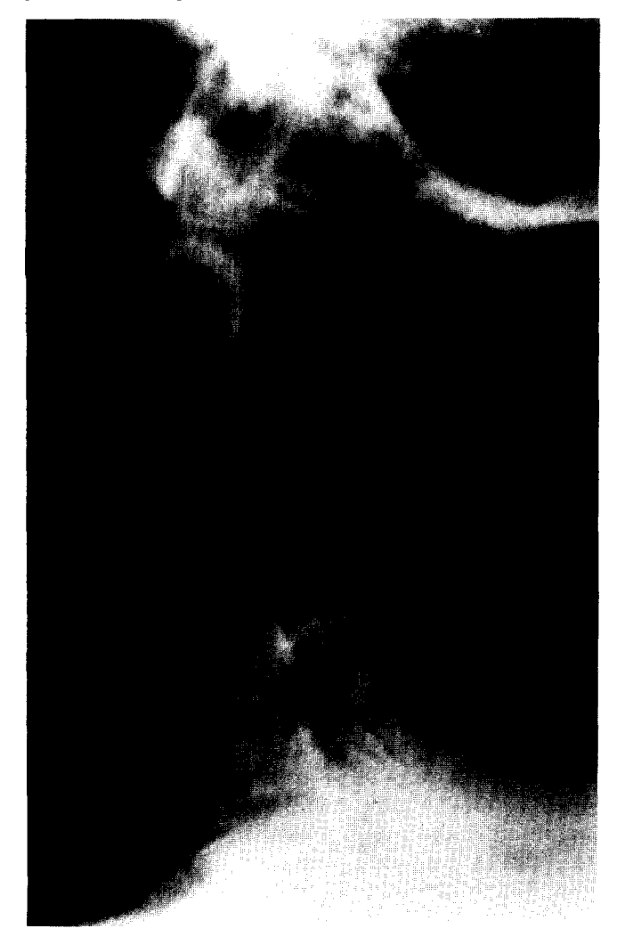
Figure 1. Preoperative lateral radiograph of the cervical spine. Degenerative changes with sclerotic autofusion of the C5–C6 vertebral bodies and prevertebral swelling at C4–C6.