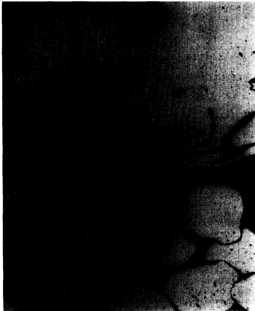
Fig 1. Photomicrograph of expectorated clot illustrating entrapped air that produced air bubbles with firm digital pressure (H & E, original magnification \times 500 ).

Several reports have detailed both the variety and incidence of complications resulting from the use of balloon-tipped pulmonary artery catheters. 1-4 Patient conditions that are thought to increase the chance of hemorrhagic complications related to the use of pulmonary artery catheters include anticoagulation, pulmonary