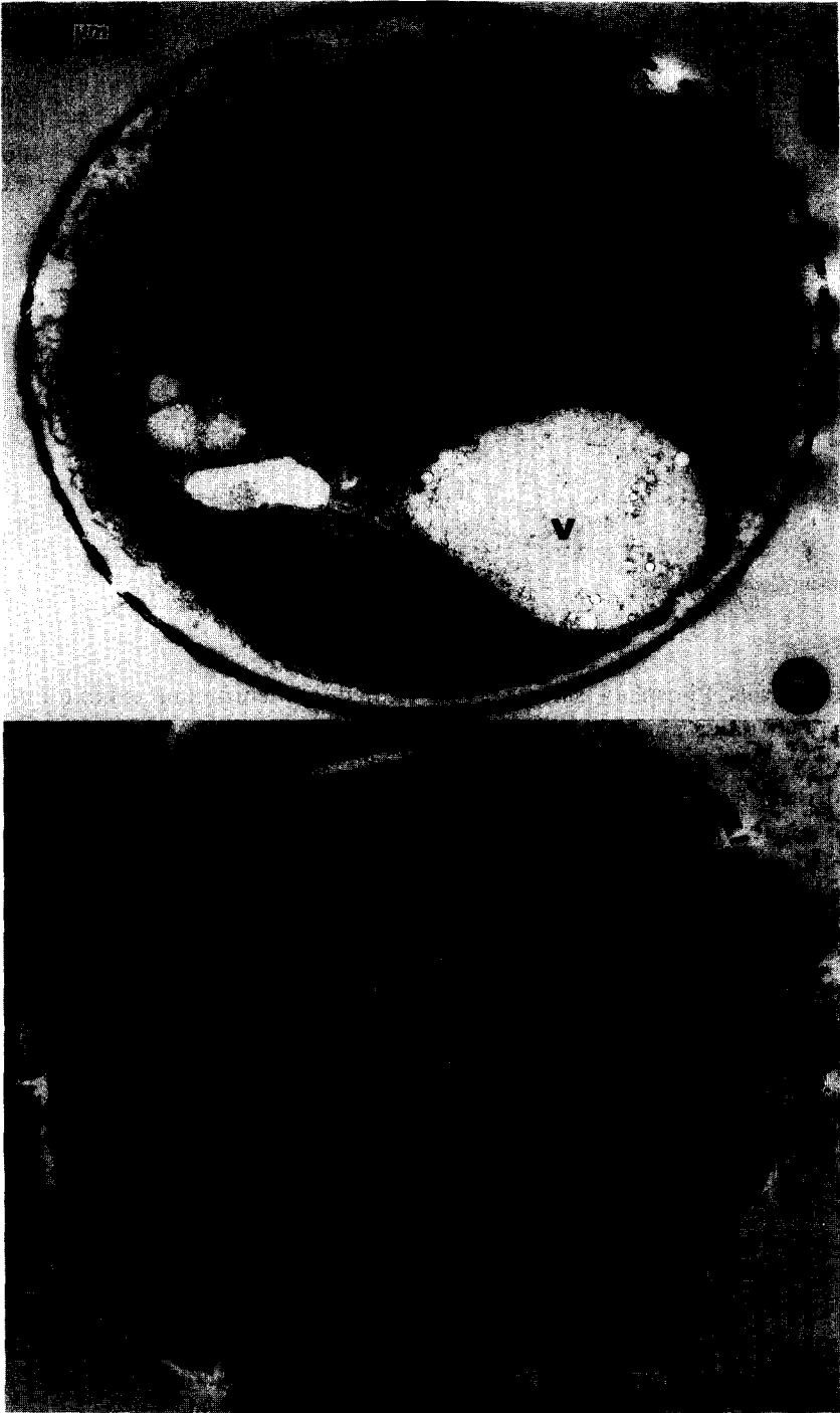
Figs. 1-5. Electron micrographs of Cyclotella meneghiniana . Key to figure legends: autophagic vacuole (AV), chloroplast (C), frustule (F), lipid (L), mitochondria (M), polyphosphate (P), vacuole (V).

Figs. 1 and 2. 1. Phosphate sufficient cell. Chloroplasts, nucleus and vacuole are present. 2. Phosphate sufficient cell treated with Cr for 7 days. Numerous polyphosphate bodies and a large area of lipid are evident.