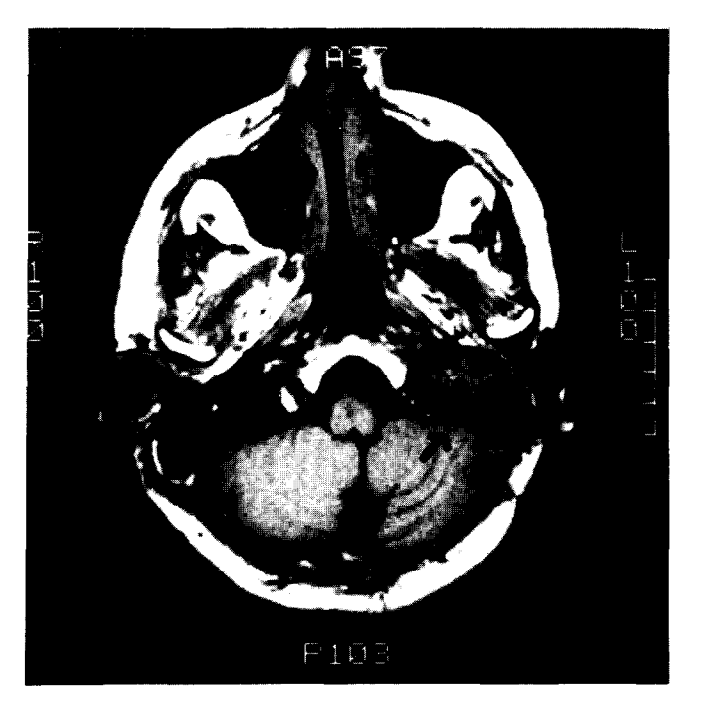
Figure 1. Axial T1-weighted MRI of a left ninth nerve schwannoma (\underline{arrow}) . The mass obliterates the internal jugular vein. This mass diffusely enhances with gadolinium.