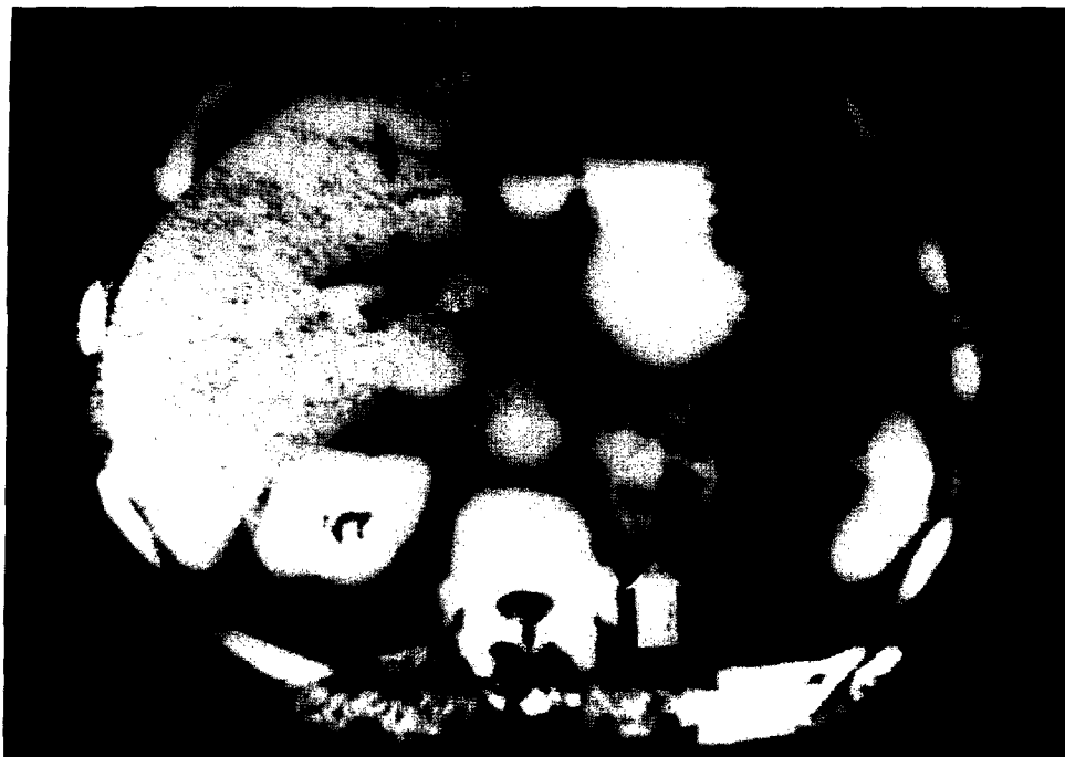
Fig. 1. CT scan reveals a 5 cm left adrenal mass with a relatively low density peripheral component and a smaller, higher density central region.

ex vivo from samples cut from the surgical specimen on an 0.5 T IBM Minispec spectrometer at 40°C, and were 637 msec and 612 msec, respectively.