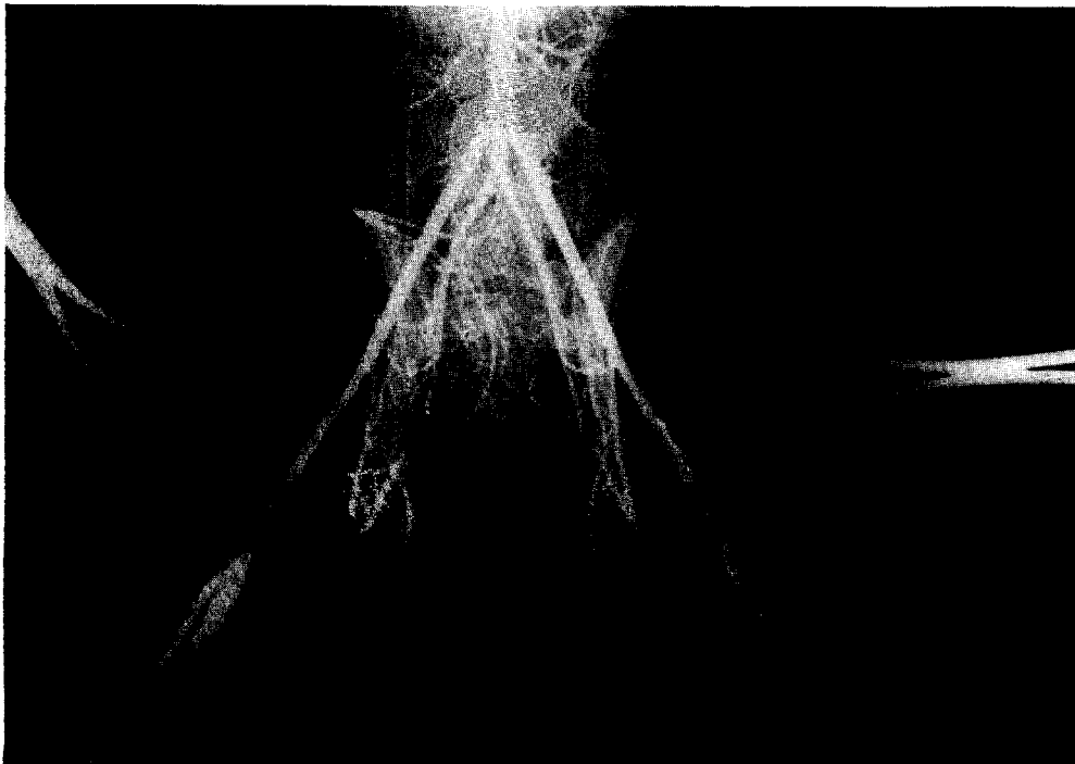
Fig. 2. Arteriogram showing lower abdominal, pelvic, and groin arterial system. An arteriovenous fistula and a femorofemoral bypass have been constructed in the right and left groins, respectively. The tip of the catheter is at bifurcation of aorta.