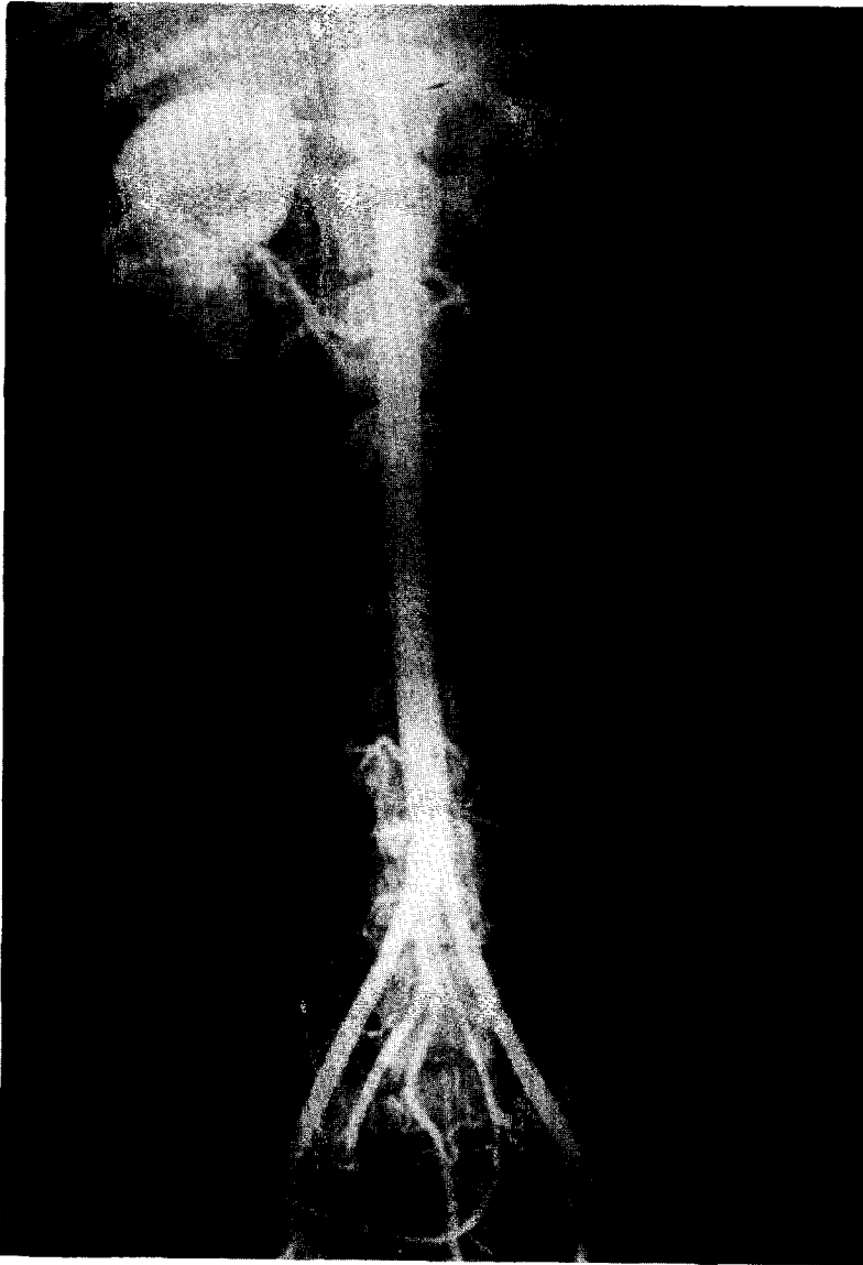
Fig. 3. Arteriogram showing abdominal aorta and its branches. The tip of the catheter is at the level of renal arteries.

With some practice in timing of the injection and exposure of the single X-ray film, an arteriogram of excellent quality could be obtained routinely (Figs. 2 and 3). These were easily reproducible and allowed precise comparative measurements of the arterial system to be made each week.