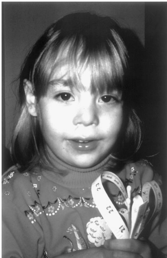
Fig. 1. Photographs depicting facial features of the patient at age 39 months.

This report describes a patient with XY sex reversal in addition to jejunal atresia, aberrant tracheobronchial