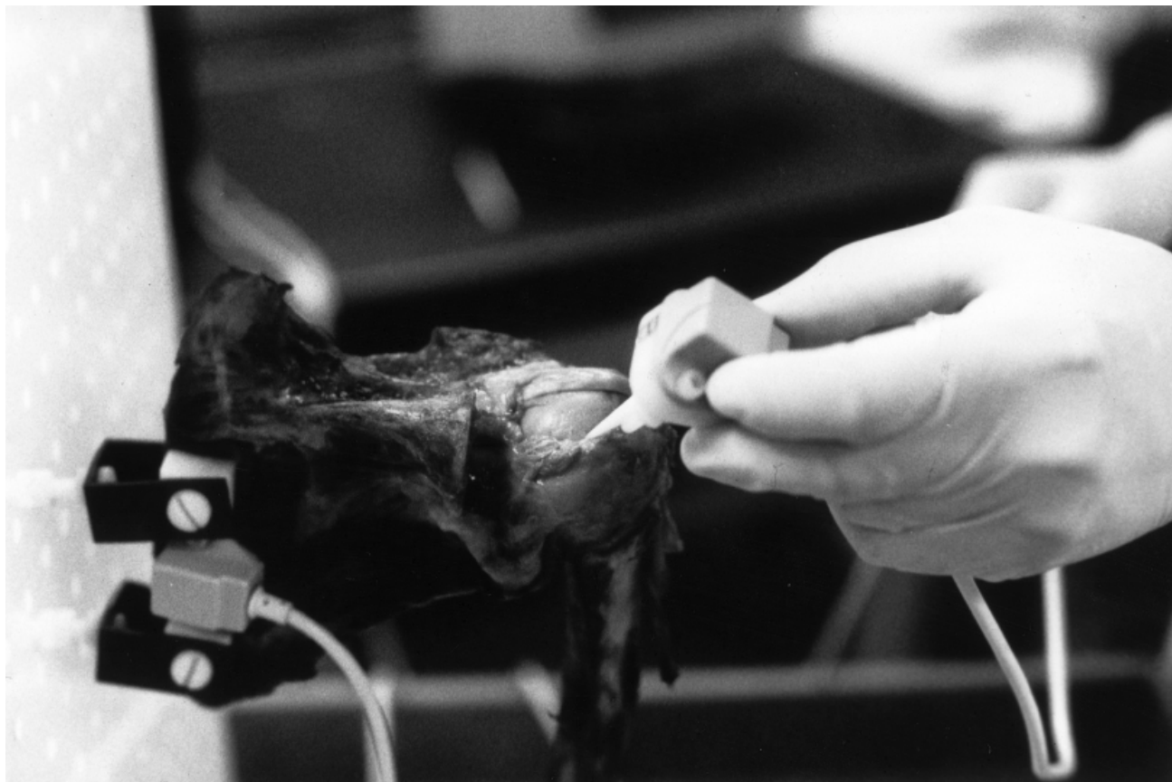
Fig. 1. A point on the border of the RCT being digitized with a probe attached to the base of a Flock of Birds sensor. The medial border of the scapula is affixed to the testing frame. A Flock of Birds sensor is rigidly mounted to the medial rim of the infraspinatus fossa.

nations Program. Since the program provides tissue to multiple institutions, it was impossible to collect the specimens in any patterned or randomized fashion. Institutional Review Board approval was obtained for this study. Of the shoulders collected, 357 specimens, ages 53–86 (mean 70), had no signs of full thickness RCTs. No information regarding the subjects' symptoms was available. Data were collected from the remaining 57 fresh frozen cadaver shoulders, ages 61–94 (mean 78). Non-rotator cuff soft tissue was dissected from each specimen. A blunt dissection of the supraspinatus muscle was performed so that the digitizing probe could be inserted under the muscle belly to contact the base of the spine of the scapula in the supraspinatus fossa. The medial border of the scapula and the mid-shaft of the humerus were mounted to a testing frame such that the humerus was suspended in a neutral position parallel to the medial border of the scapula in the plane of the scapula. Once the bony landmarks had been digitized, the acromion was removed with a Stryker Bone Saw (Stryker, Kalamazoo, MI) for better access to the RCT.