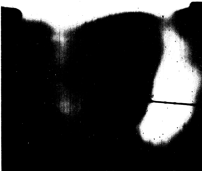
Fig. 2 Photograph of Drops Thrown from a Spinning Disc. The liquid used in this experiment was kerosene .