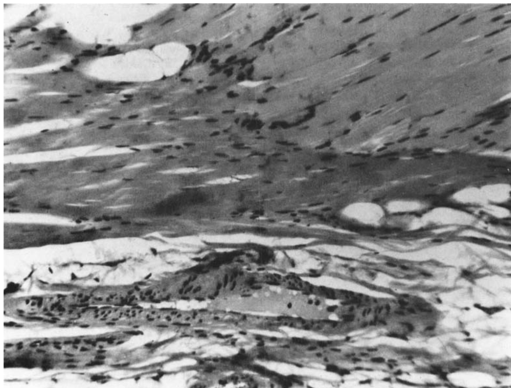
Figure 3. Deltoid muscle biopsy demonstrating normal muscle fibers and arterioles (hematoxylin-eosin; \times 160 ).