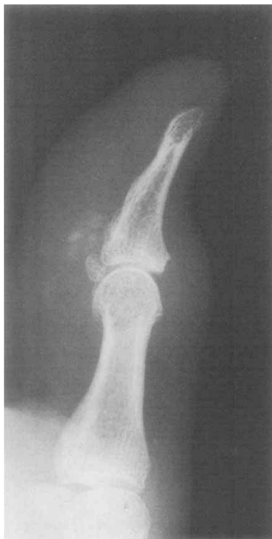
Figure 2. Repeat radiograph 2 days after admission and prior to treatment, demonstrating breakdown of deposit into multiple small, ill-defined masses.

Cohen in 1924 (7) described the first case of acute calcific tendinitis in the hand in a 28-year-old