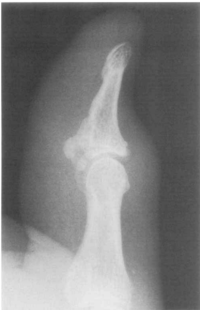
Figure 1. Radiograph at admission, demonstrating dense calcific deposit around interphalangeal joint with associated sesamoid bone.

week revealed total resolution of swelling and pain. A radiograph 6 months later (Figure 3) showed that the calcific deposits had completely disappeared. She remained asymptomatic during the followup period.