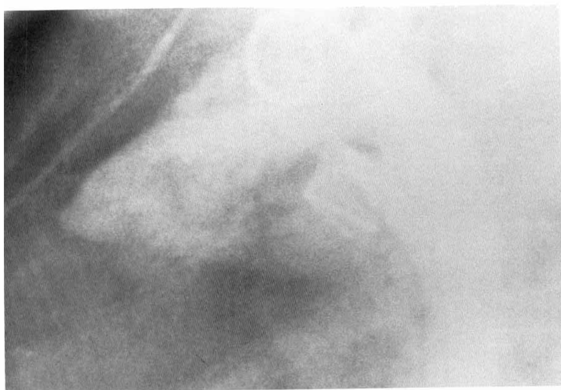
Fig. 1A and B.