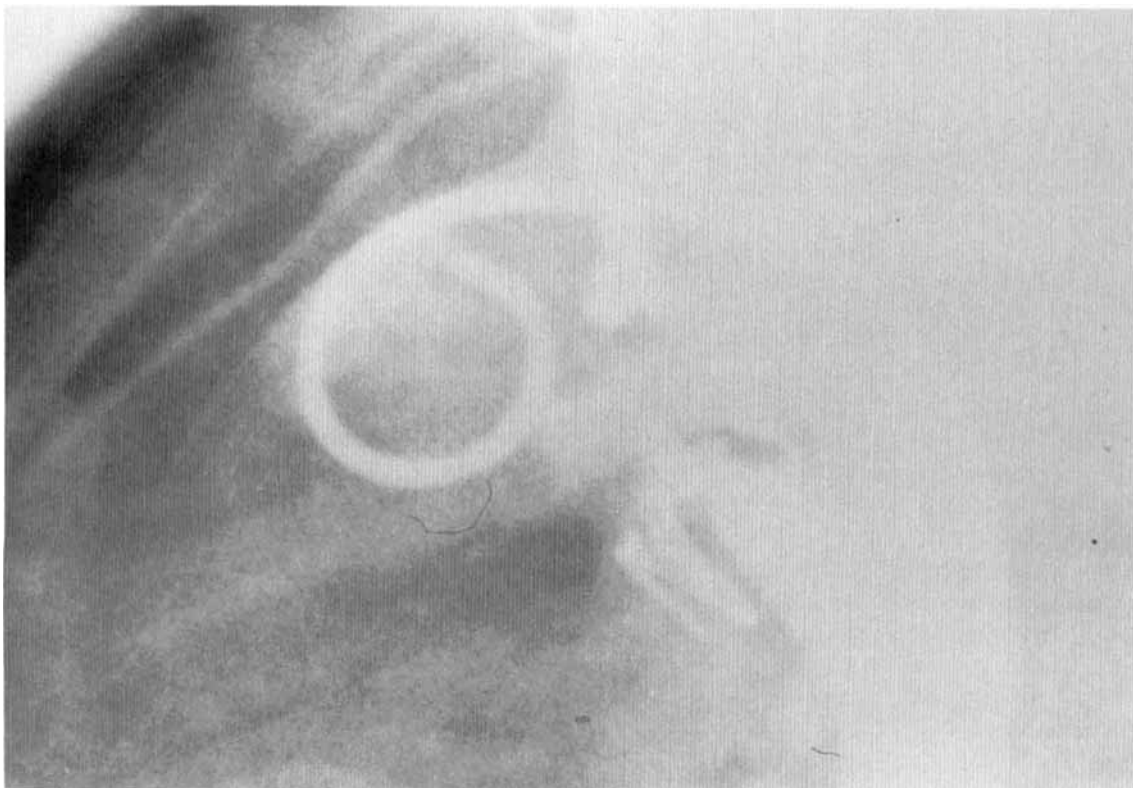
Fig. 1. A: Initial lateral aortogram revealing a large left-to-right shunt through a patent ductus arteriosus. B: After placement of 2 Gianturco coils, a small residual shunt is seen. Note the large

coil loops in the lumen of the pulmonary artery. C: At a repeat coil procedure, 3 additional coils are implanted into the ductus with trace residual shunt noted on the final aortogram.