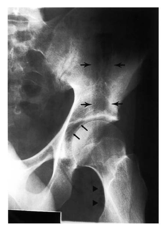
Fig. 2. Pelvic AP radiograph shows a small amount of subcutaneous air around the hip joint ( arrowheads ); the medial cartilage of the femoral head is outlined by air ( small arrows ), indicating definite gas within the joint. A long tubular radiolucent region ( arrows ) can also be seen, representing gas within the hollow bamboo stick. Prospectively, this was initially thought to represent artifact from the backboard

bamboo stick to the descending colon (Fig. 3a), there was no injury to the bowel or any major vessels. After 5 days, the patient was discharged.