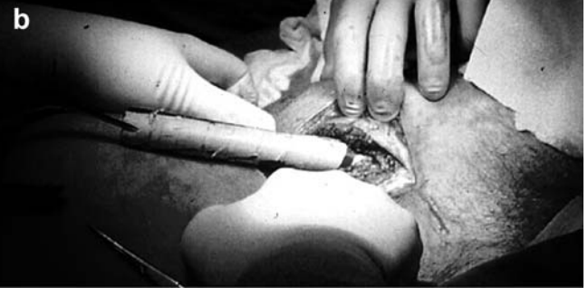
Fig. 4a, b. Intraoperative photographs. a Initial incision, exposing the taped-wrapped bamboo stick fragment. The entire 13-cm stick (b) was extracted from the incision without complication