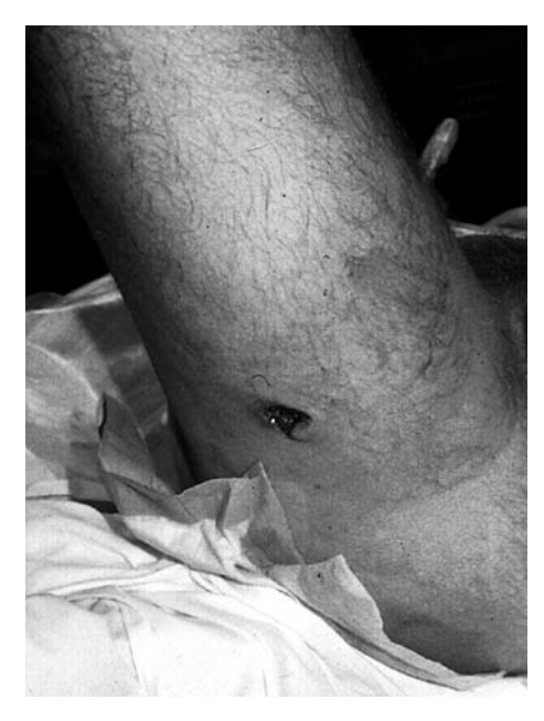
Fig. 1. Photograph of left thigh showing a small puncture wound at the posterolateral aspect of the upper thigh