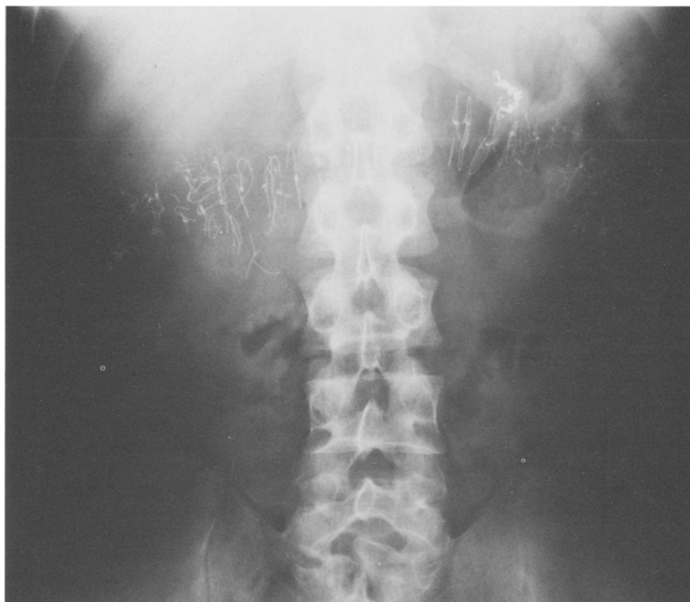
Fig 1. Abdominal x-ray obtained on admission revealed numerous wire sutures used in the closure of the abdominal wall. The examination was otherwise normal.

of aspirin or other drugs. Eight years prior to admission, he underwent vagotomy and antrectomy with a Billroth I gastroduodenal anastomosis for a bleeding gastric ulcer and 6 years prior to admission, he sustained injuries in a motor vehicle accident and required an emergency laparotomy in which splenectomy and right adrenalectomy were performed and a hepatic laceration was sutured. Both operations were performed through an extended left subcostal incision. The abdomen was closed in layers with a series of interrupted wire sutures in both cases. Neither operation was complicated and the patient's ulcer disease had not recurred. On physical examination, the patient's vital signs were relatively stable with a heart rate of 90-110 and a blood pressure of 100/50 in the sitting position. The abdomen was soft and nontender with hyperactive bowel sounds. Rectal examination revealed only the presence of bright red blood. Laboratory tests obtained on admission revealed a hematocrit of 39.1% with a WBC of 8600 cells/mm 3 . His prothrombin time was 67%, and his partial thromboplastin time was 47 sec with a control of 35 sec. His platelet count was 255,000. Liver enzymes were mildly elevated with an alkaline phosphatase of 251, an SGOT of 178, and a SGPT of 67. Total bilirubin