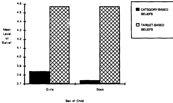
Fig. 1. The effect of child sex on parents' category- and target-based beliefs about adolescence. (Higher mean level of belief is more stereotyped.)

target-based beliefs in accordance with stereotypes than fathers, and that stereotypes were more prevalent for daughters than sons.