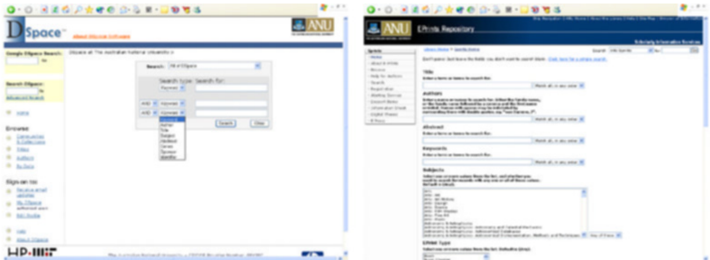
Figure 1. Advanced search form in DSpace (left) & the upper part of the advanced search form in Eprints (right)

The design of Eprints advanced search form did not fulfill several heuristics suggested by Nielsen. First, the complex advanced search form did not provide simple and natural dialog. In addition, some of the search options were not represented as users' language, such as refereed or status. Also, once users chose one of the options provided in the drop-down box, it would not be back to the initial unselected stage unless users pressed either a reset button at the bottom or a refresh button in the web browser. This design had users trapped in the search form and it did not provide a clearly marked exit. The advanced search form was also error-prone, particularly in the author search box. The author search box designated the format of author name when users used both first and last name. The format was "last name, first name". If users just submitted a first name then a last name without quotation marks, they did not get any results. Therefore, the advanced search tasks were assumed to be more easily performed in DSpace than Eprints.