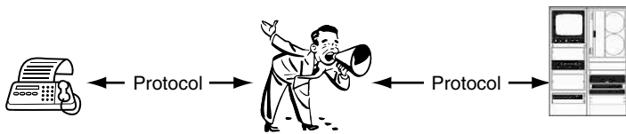
Figure 7.2. Telecom interface with translator.

possible to publish only one side of the specification and design components on that side.